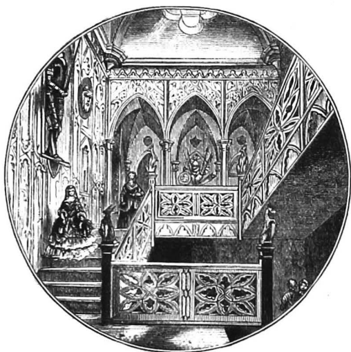
STAIRCASE AT STRAWBERRY HILL