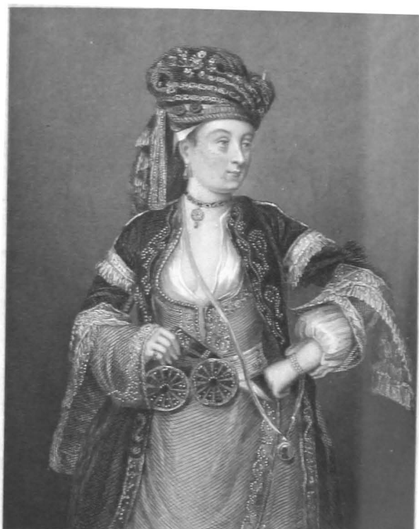
LADY MARY WORTLEY MONTAGU.