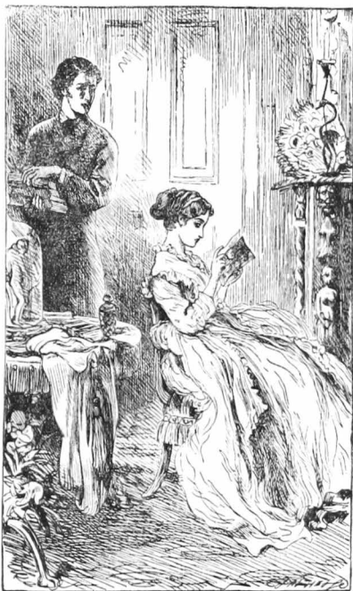
PA'S LODGER AND PA'S DAUGHTER