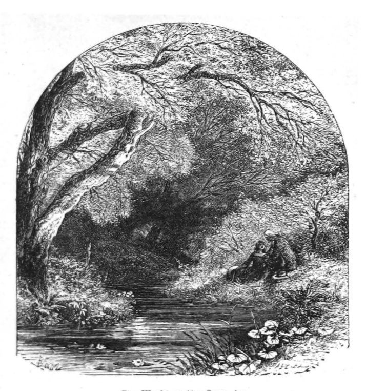
The World in the Open Air.