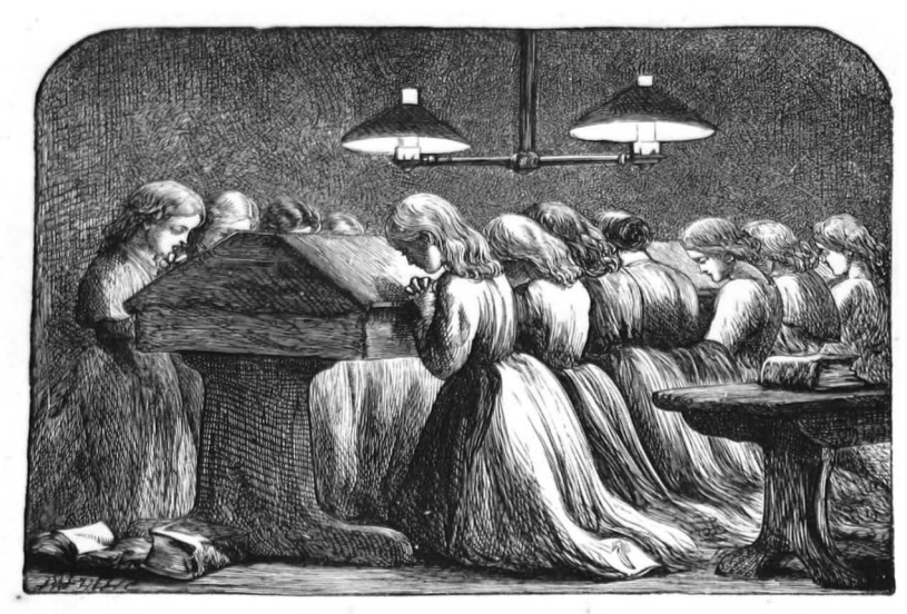
Evening Prayer at a Girls' School