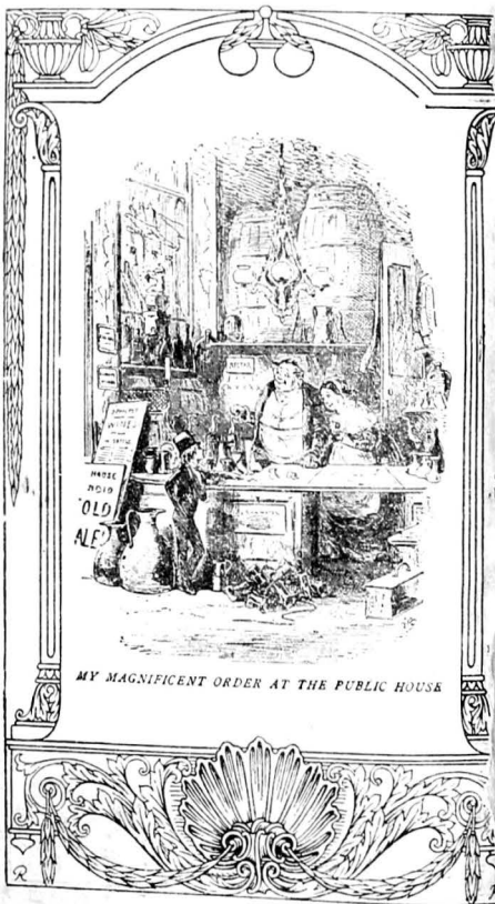
MY MAGNIFICENT ORDER AT THE PUBLIC HOUSE