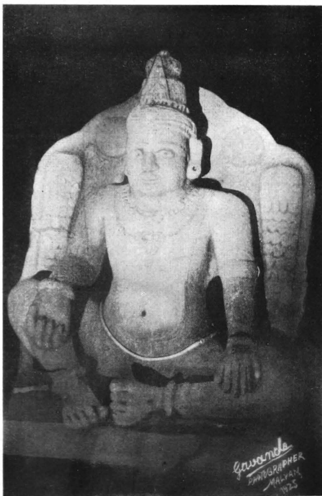
Image of Shivaji at Malwar