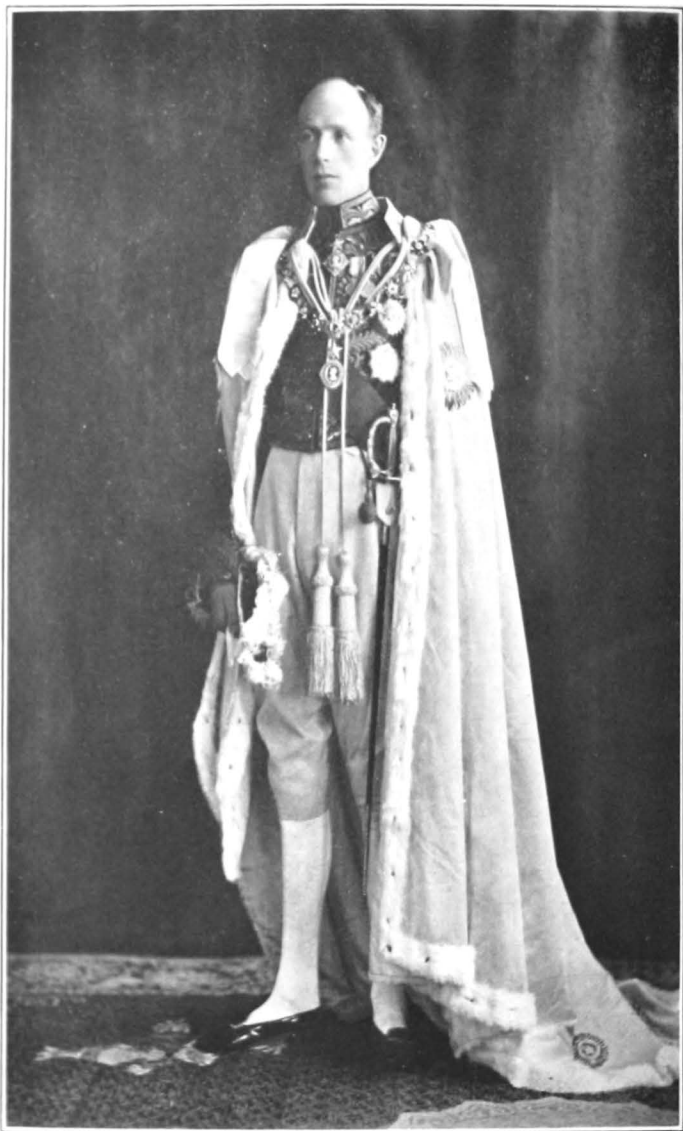
His Excellency the Right Hon. Edward Frederick Lindley Wood, Baron Irwin of Kirby Underdale, G.M.S.I., G.M.I.E., Viceroy and Governor-General of India.