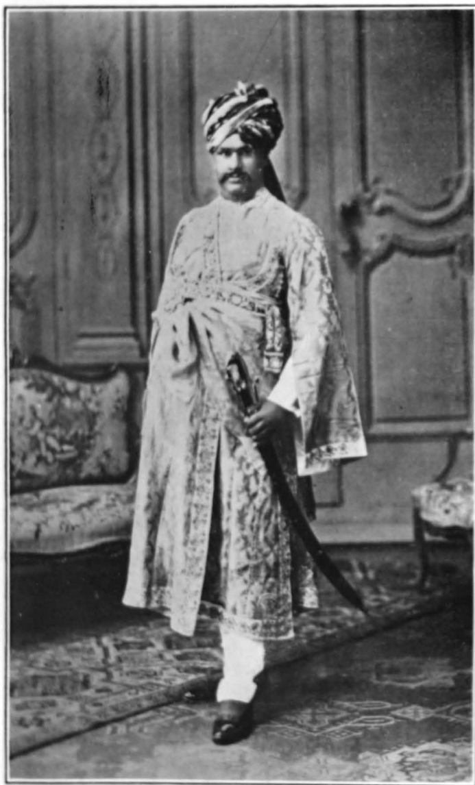
His Highness Sir Shri RAJARAM CHHATRAPATI, G.C.I.E., MAHARAJA OF KOLHAPUR.