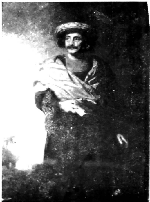
RAJA RAM MOHUN ROY.