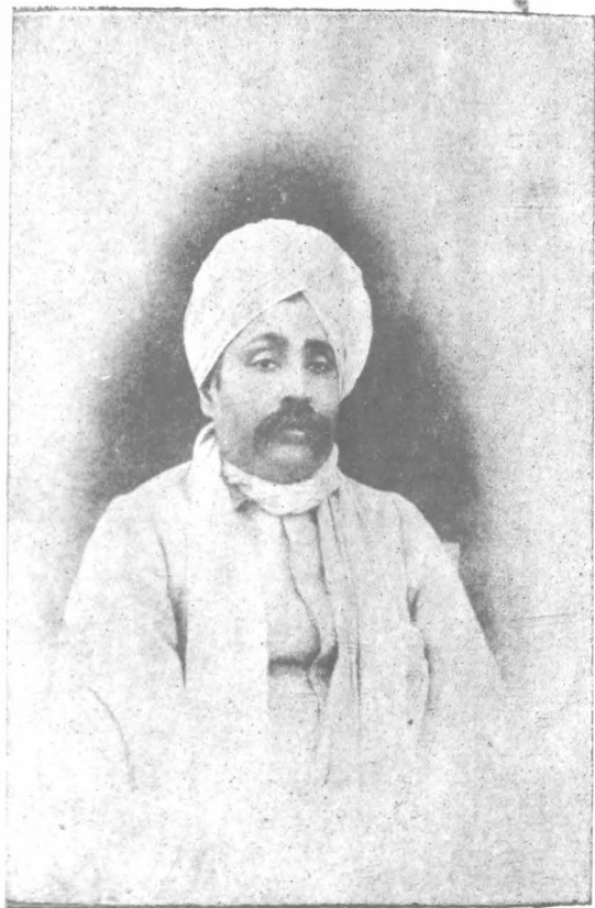
LALA LAJPAT RAI.