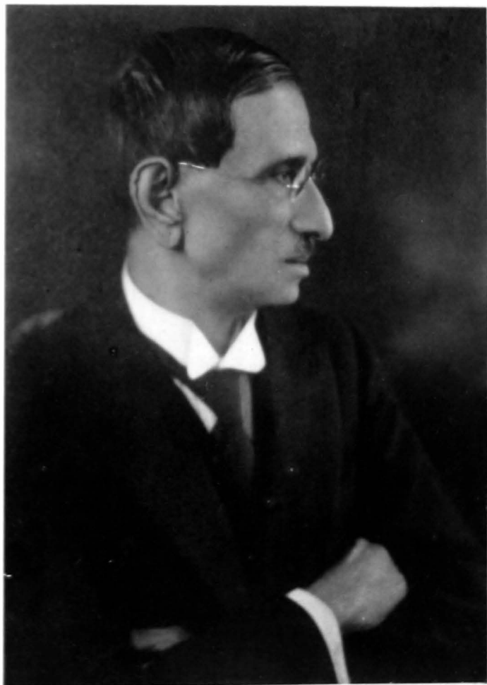
Sir Chimanlal H. Setalvad