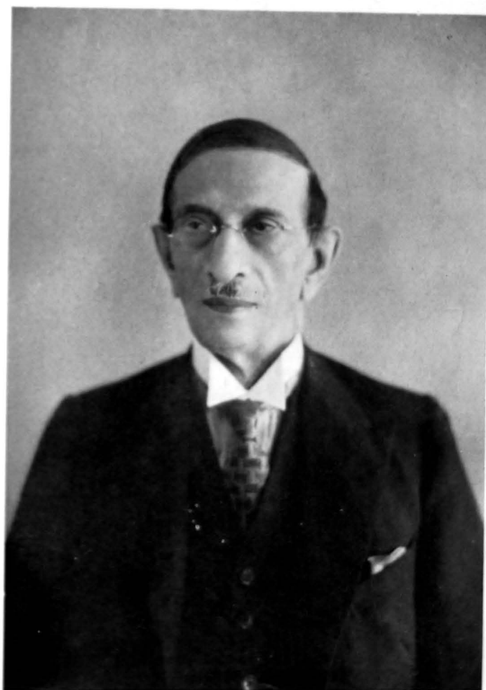
Dr. Sir Chimanlal H. Setalvad