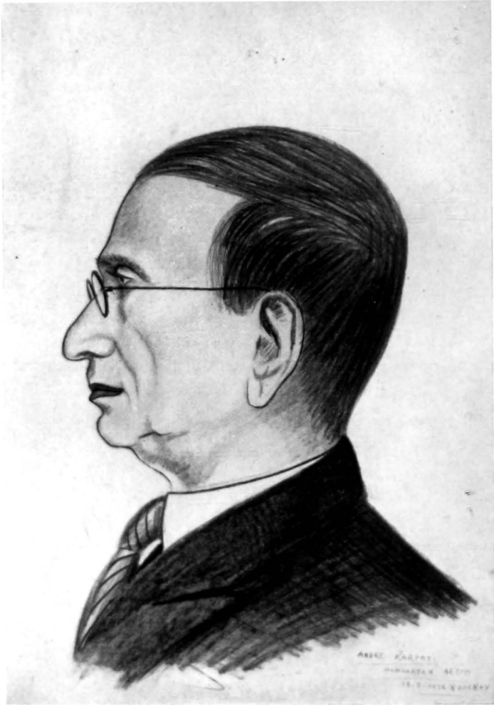
Sir Chimanlal H. Setalvad