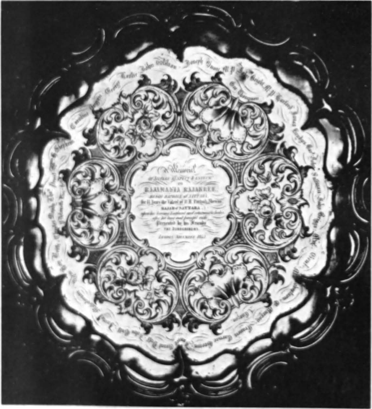
THE SILVER PLATE PRESENTED TO RANGO BAPOJEE