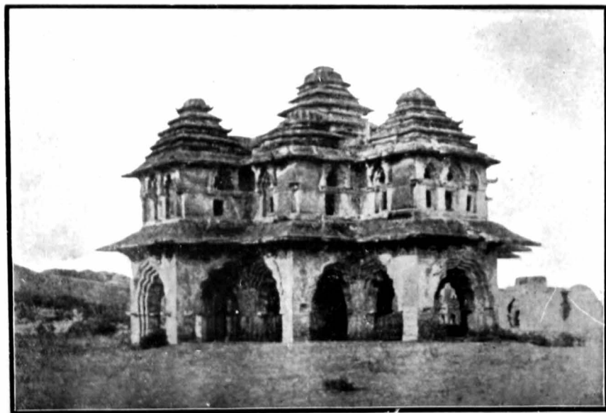
Council Chamber, Vijayanagar.