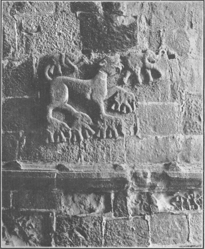
HERALDIC DEVICE AT THE ENTRANCE OF THE FORT OF DANDA-RAJPURI