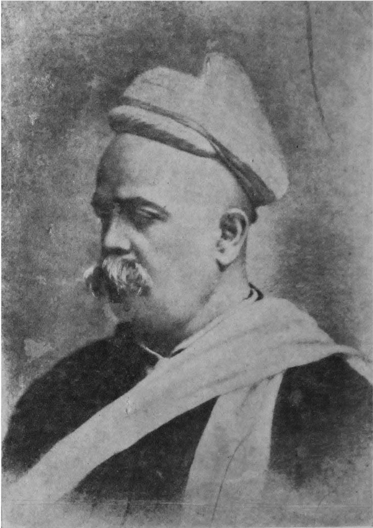
Justice M. G. Ranade.