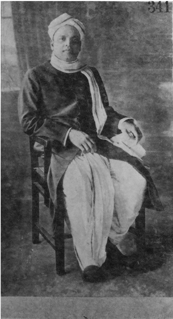
The Hon. Mr. V. S. Srinivasa Sastri, President of the Servants of India Society.