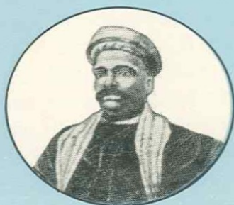
MR. B. G. TILAK