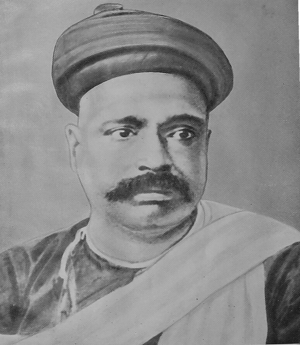
Hon'ble B. G. TILAK