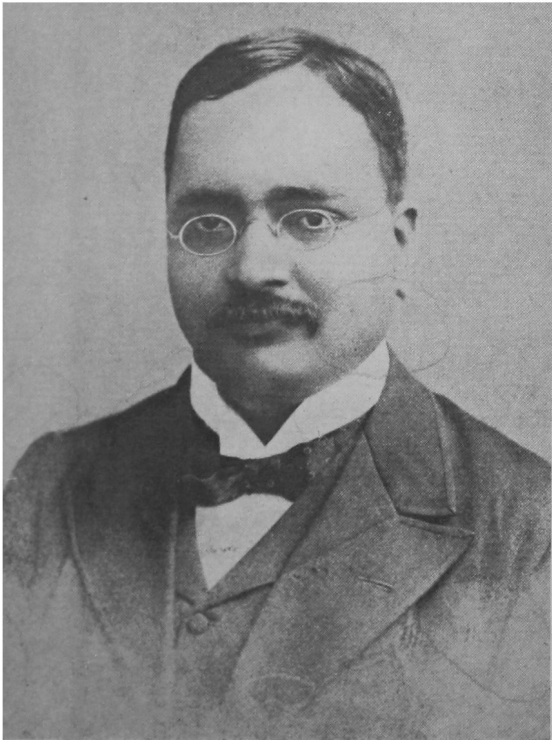
G. K. GOKHALE in London, 1897