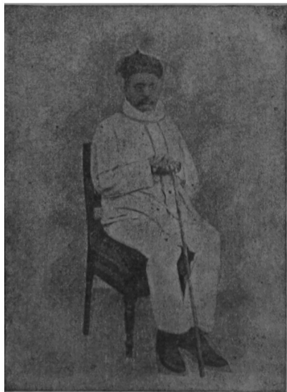
Member Bombay Legislative Council—1899