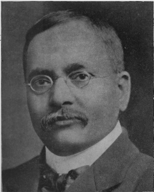
The Hon. Mr. Gopal Krishna Gokhale as witness before the Welby Commission in England, 1897.