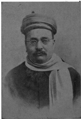
President Indian National Congress Benares. 1905