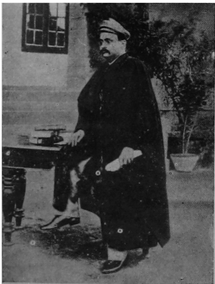
On Retirement from the Fergusson College 1902.