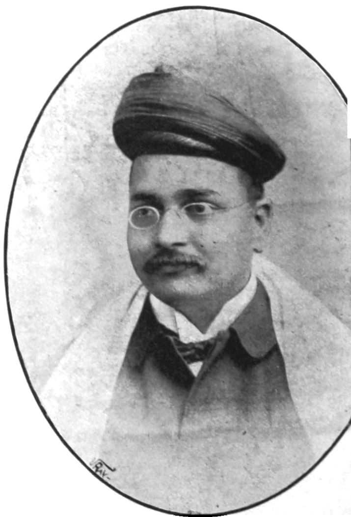
G. K. GOKHALE.