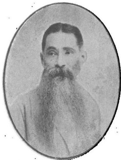
WOMESH CHUNDER BONNERJEE.