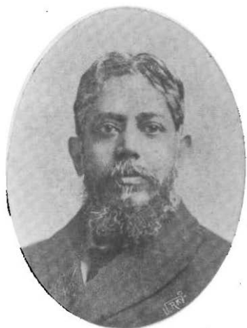
ANANDA MOHUN BOSE