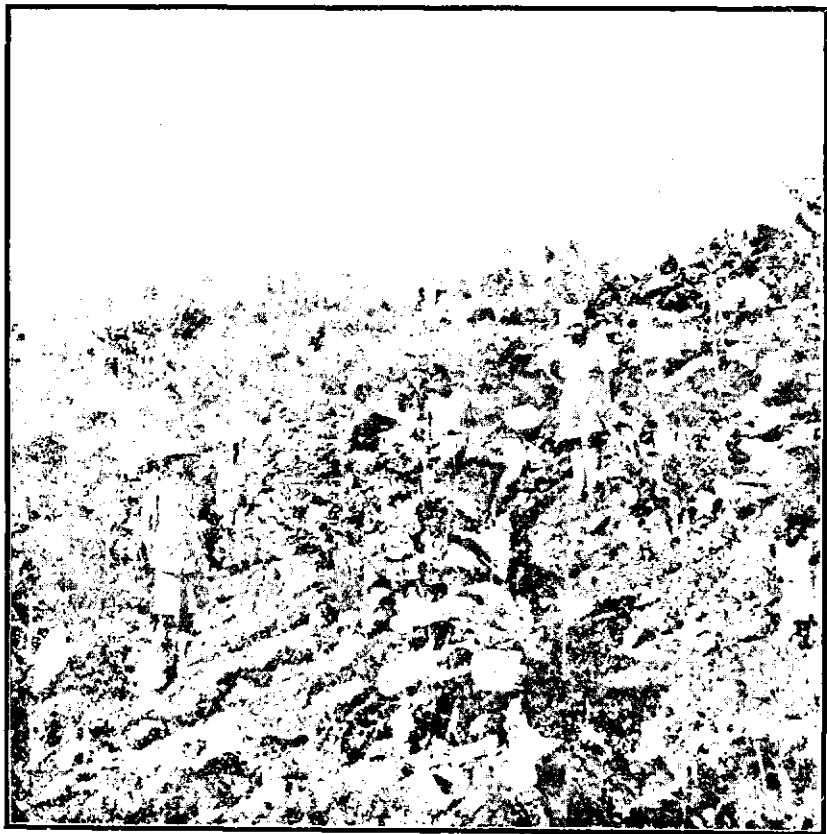
Teak plantation. 10 months old in Bouldery soil, coupe 23 of F. S. XXVI. Nikne Round, Kasa Range, North Thana Division Northern Circle. (Average height 5 feet).