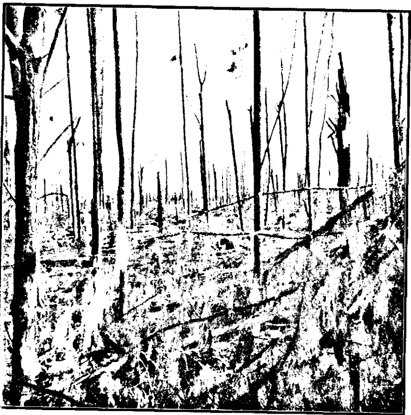
Cyclone damage in casuarina plantation at Chikhala-Gholwad, North Thana Division, Northern Circle. (Approximately 20 years' old plantation).