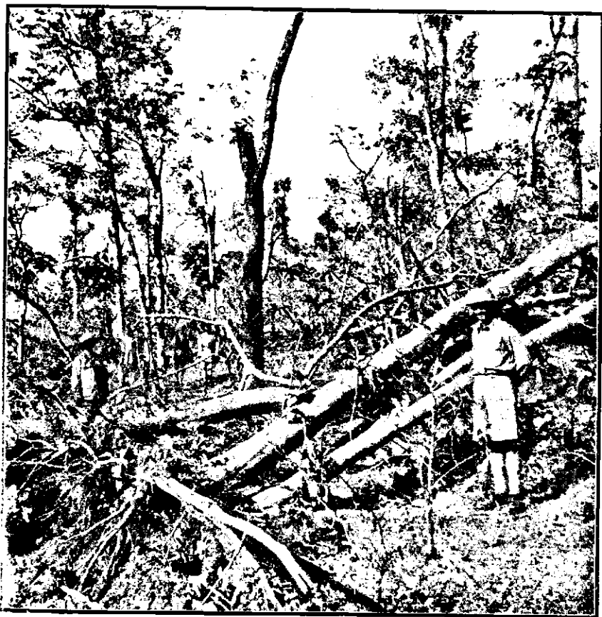
Cyclone damage in reserved forests coupe No. 77 F.S.II, Girgaon Round in Sanjan Range, North Thana Division, Northern Circle. (A coupe under II thinning).