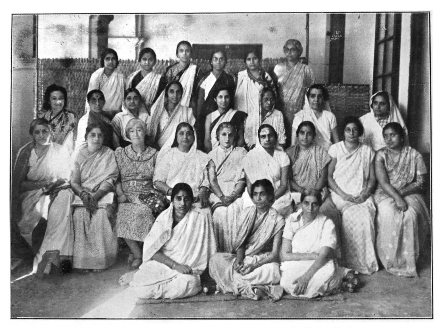
Members of the Standing Committee of the A.-I. W. C. for 1941.