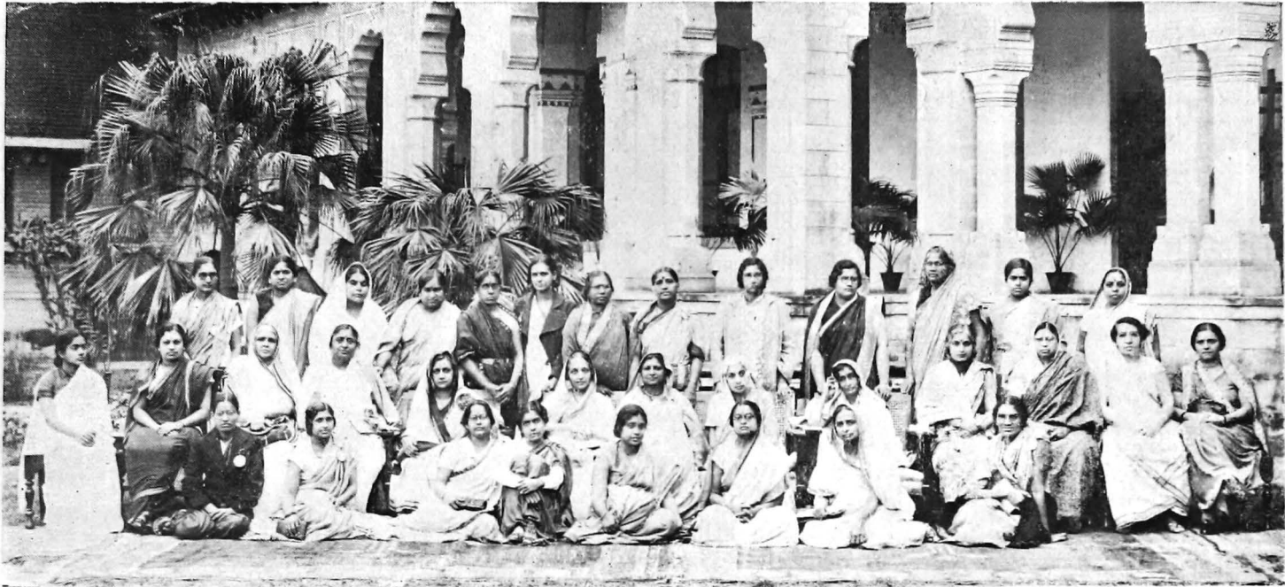
Members of the Standing Committee, 1939.