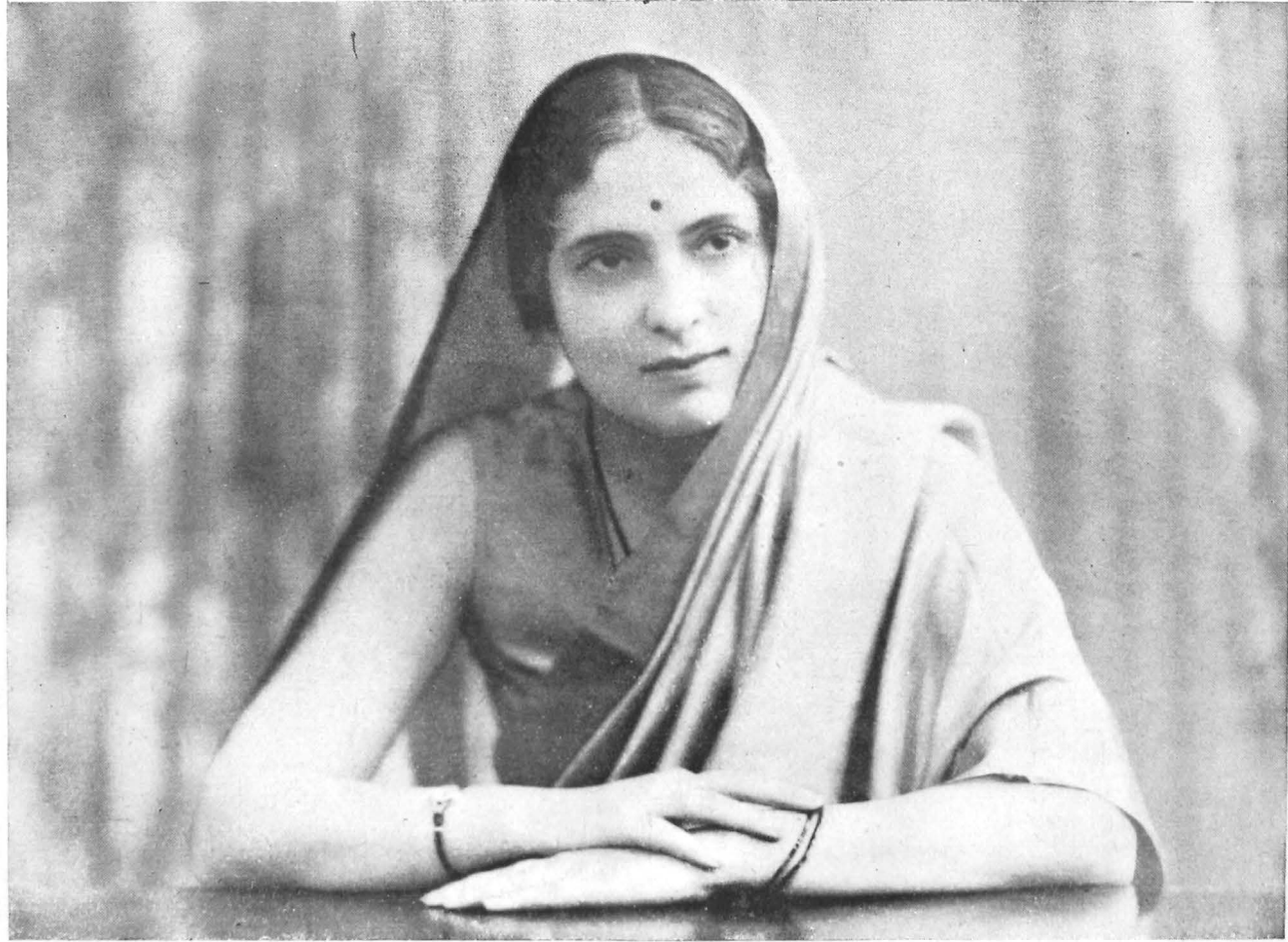
Mrs. Vijaya Lakshmi Pandit, Chairwoman, Reception Committee, Allahabad.