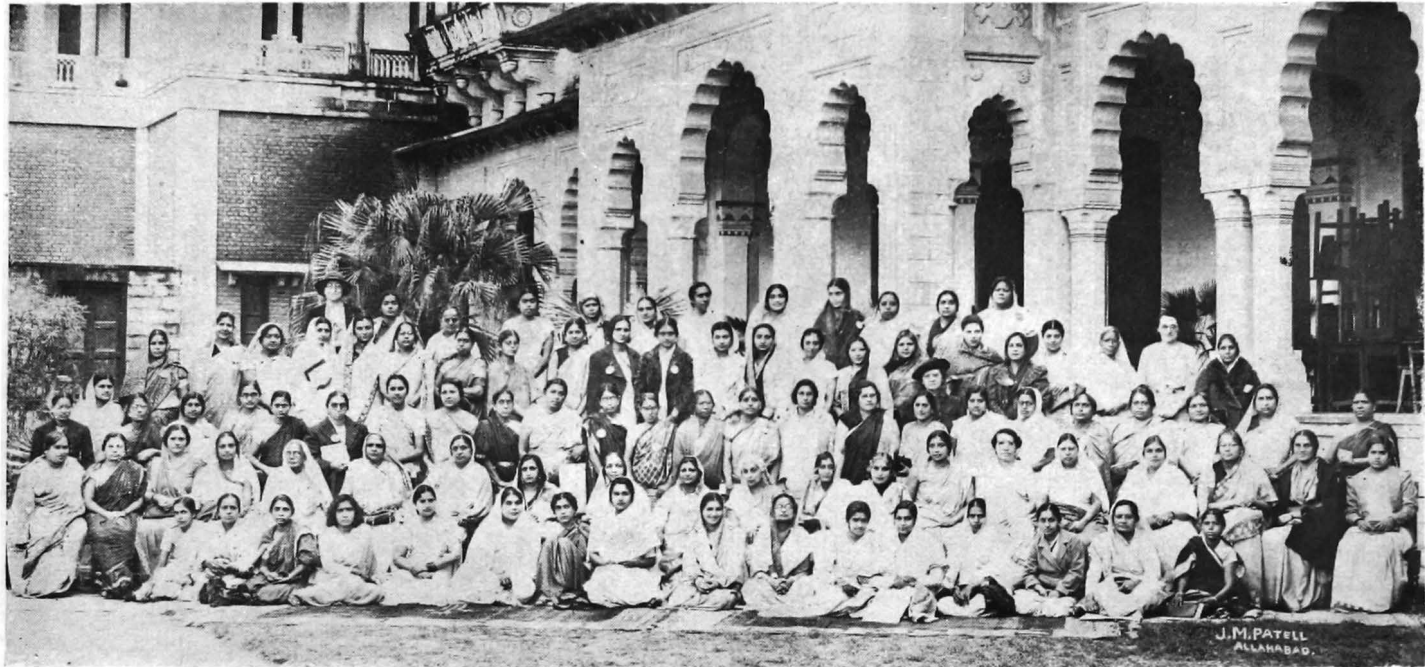
Delegates to the Fourteenth Session, January, 1940.