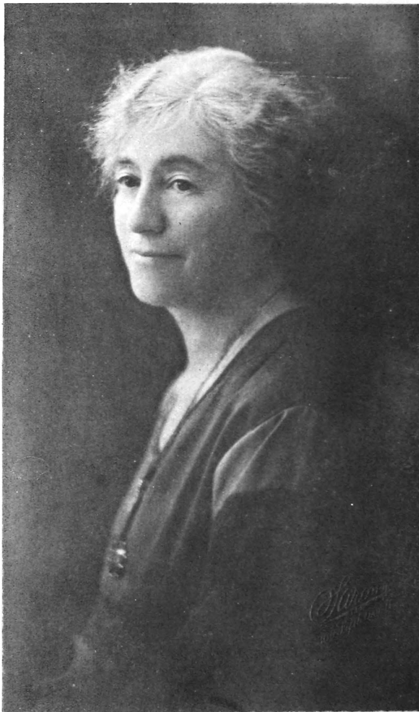
Mrs. Margaret E. Cousins, President, All India Women's Conference, 1936. •