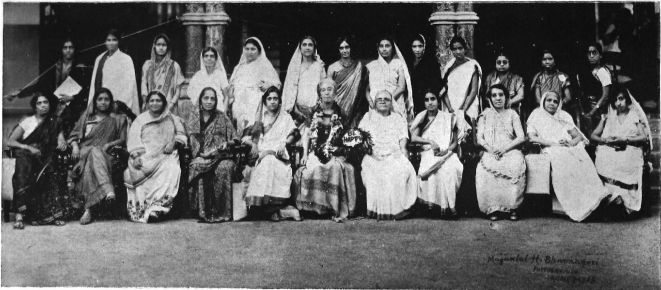
Members of the Standing Committee, 1936.