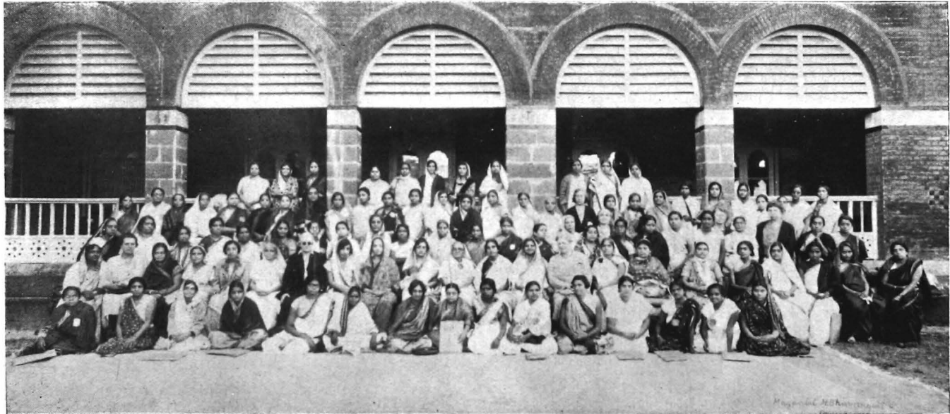
Delegates to the Eleventh Session, 1936.