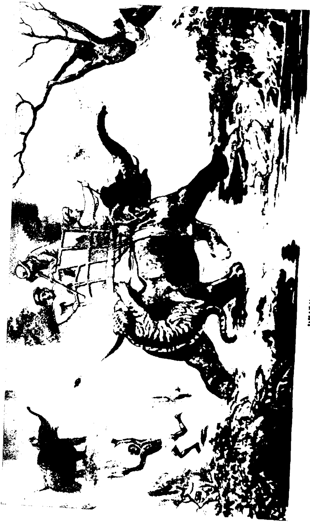
DEATH OF THE MAN