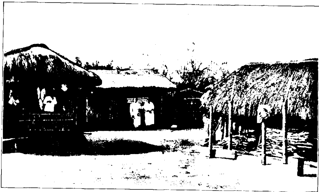
VILLAGE HOME IN ASSAM