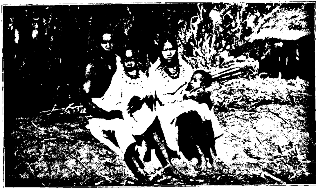
A CHRISTIAN NAGA PASTOR AND HIS FAMILY