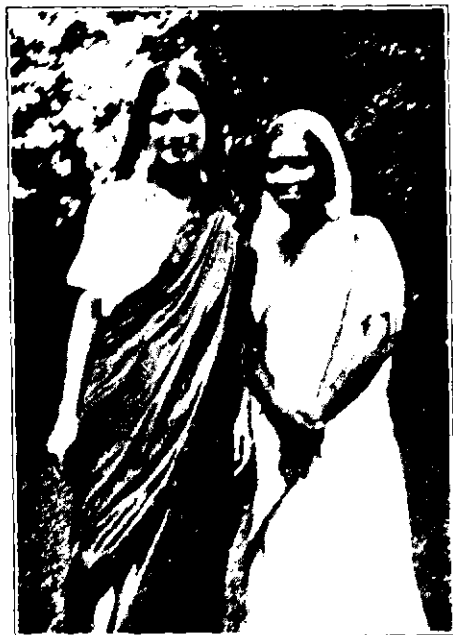
FIRST CHRISTIAN COLLEGE GRADUATES The Taller Girl Is Taking Up Law