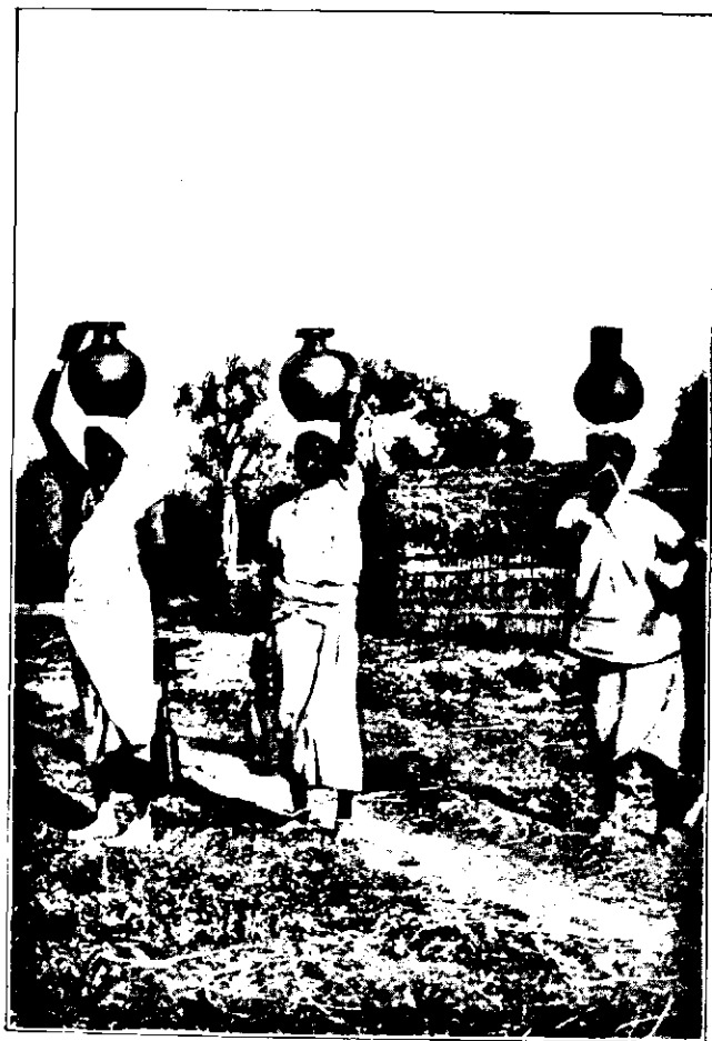
VILLAGE WOMEN OF THE COOLIE CLASS, ASSAM These Belong to the Immigrant Classes from Central India