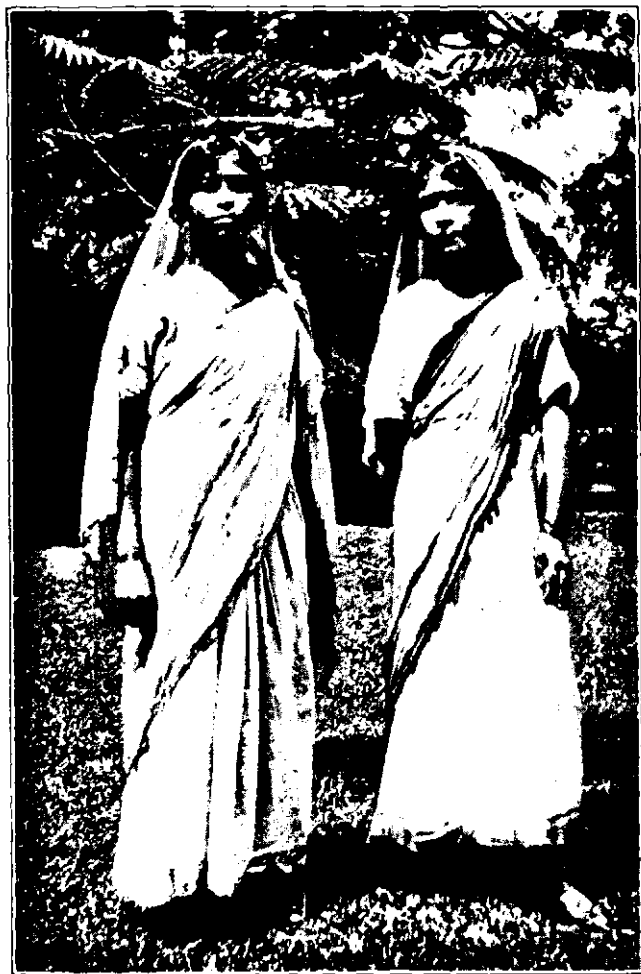
OUR FIRST "LADY DOCTORS" Christian Girls