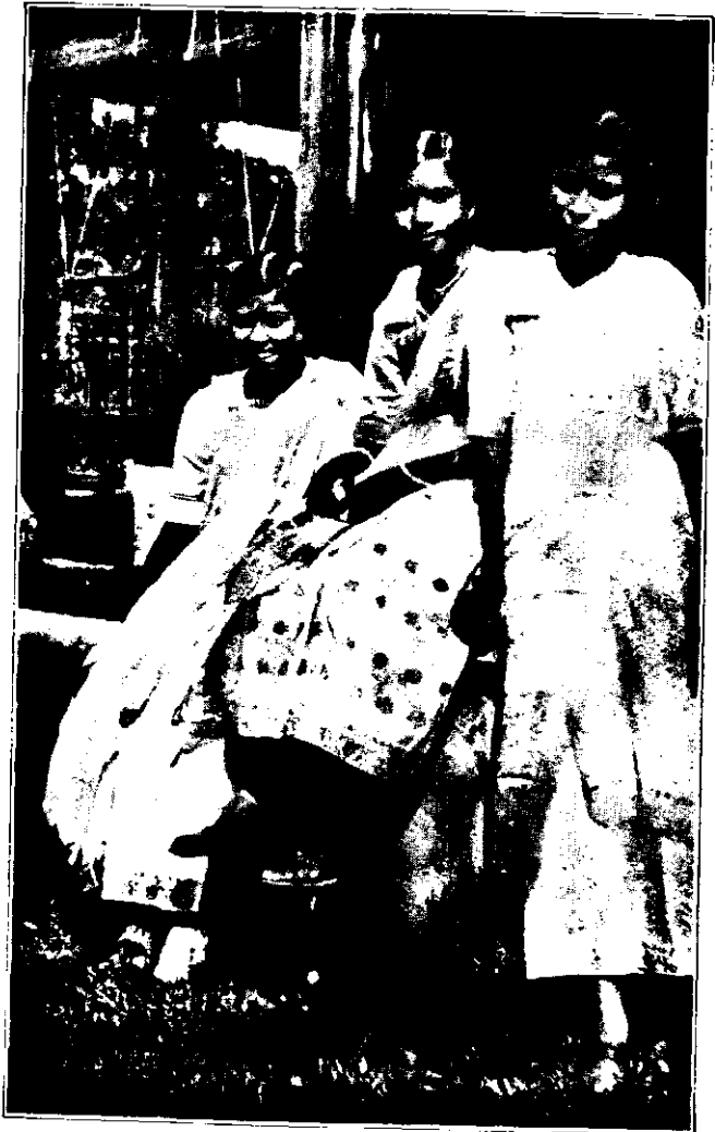
THREE ASSAMESE HINDU GIRLS OF HIGH CASTE Who Studied in the Normal Department of Our School They Are Sisters