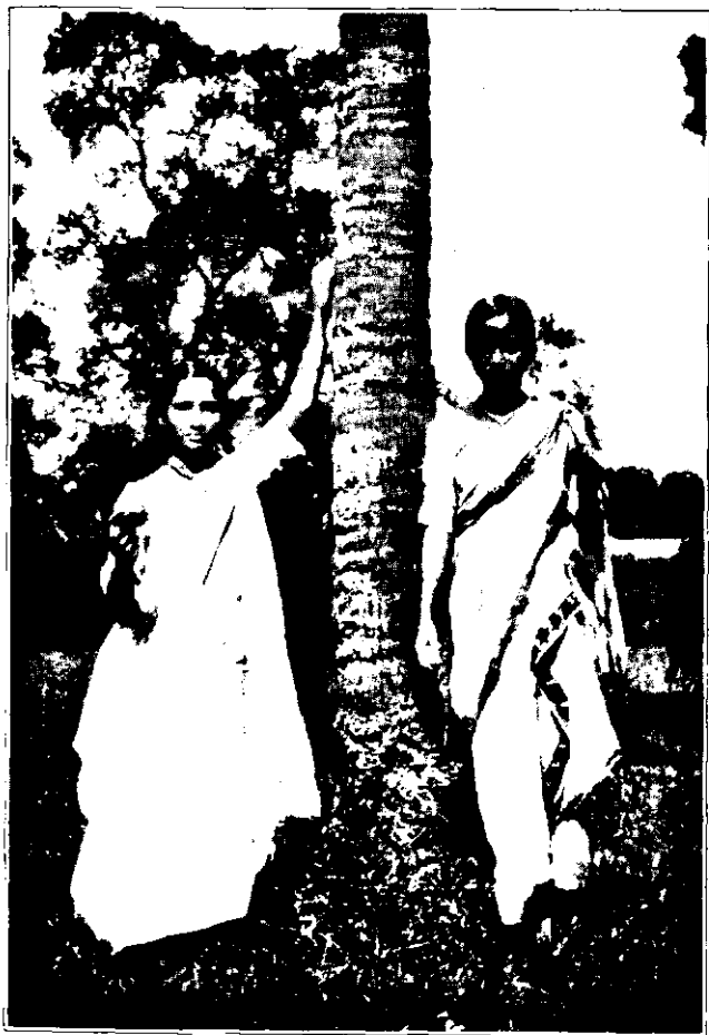
ASSAMESE GIRLS SHOWING THE TWO TYPES OF DRESS

The True Assamese Costume Shown at the Right