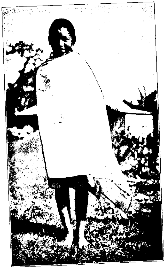
A NAGA GIRL