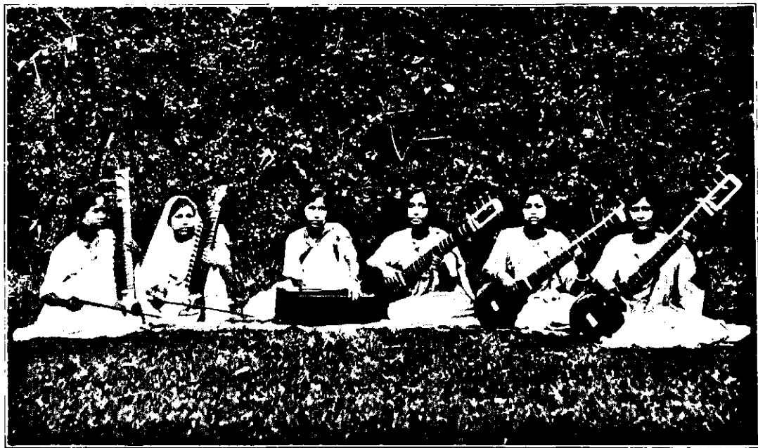
SCHOOL GIRL MUSICIANS, ASSAM