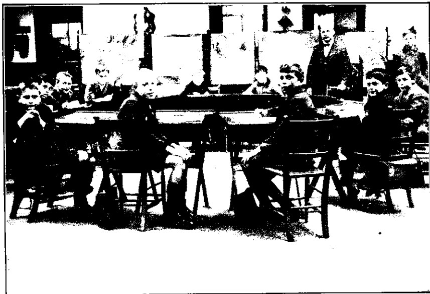
THE DRAWING ROOM.