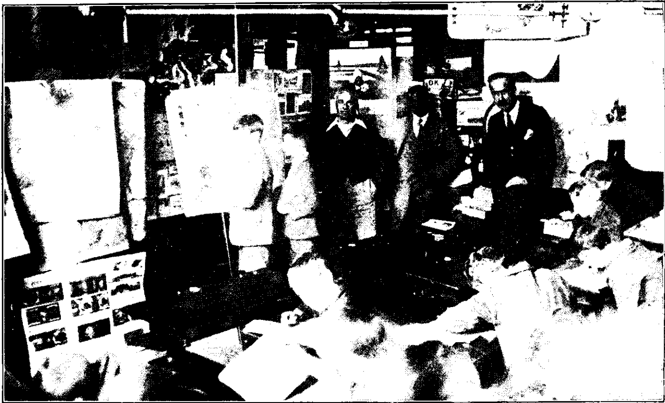
THE GEOGRAPHY ROOM.