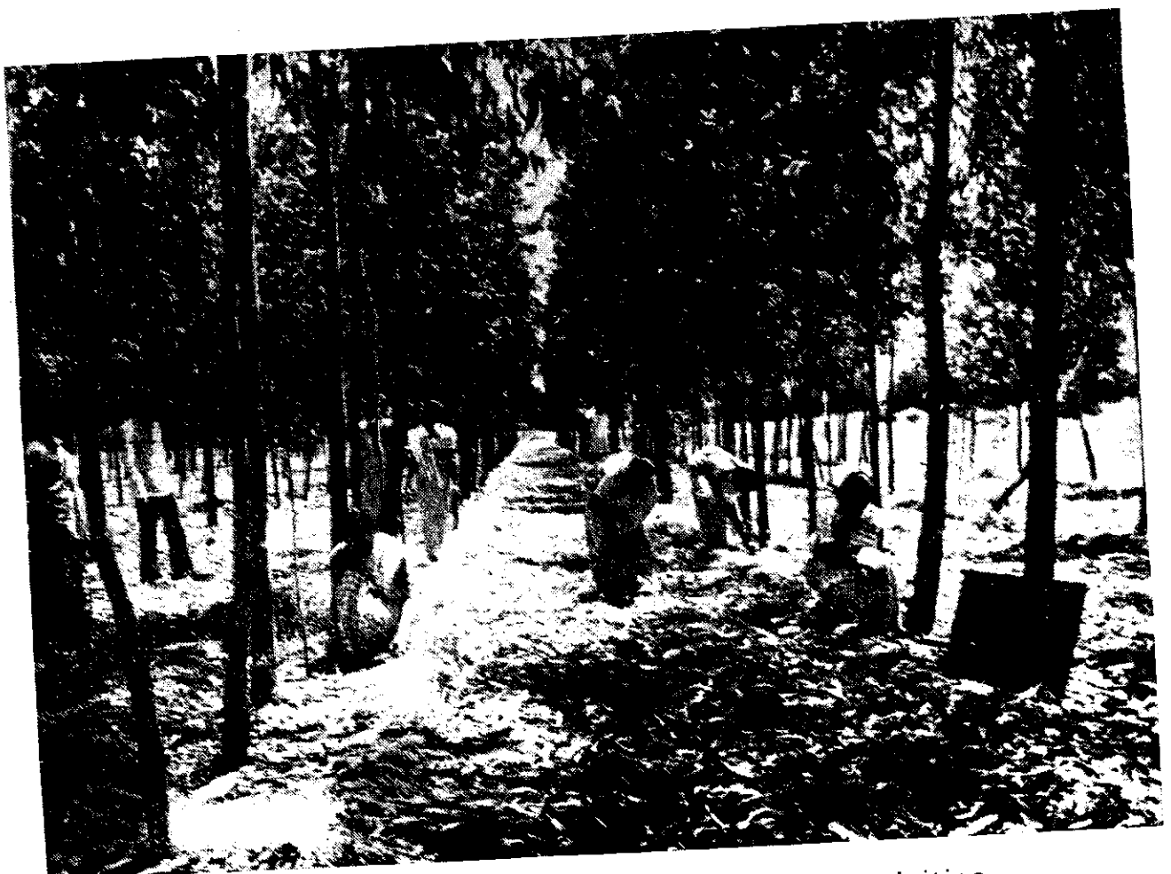
Tribal women engaged in afforestation activities