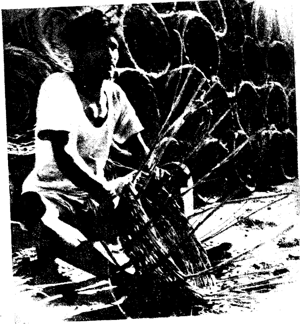
A 'Kotwalia' engaged in basket making in Dangs area of Gujarat