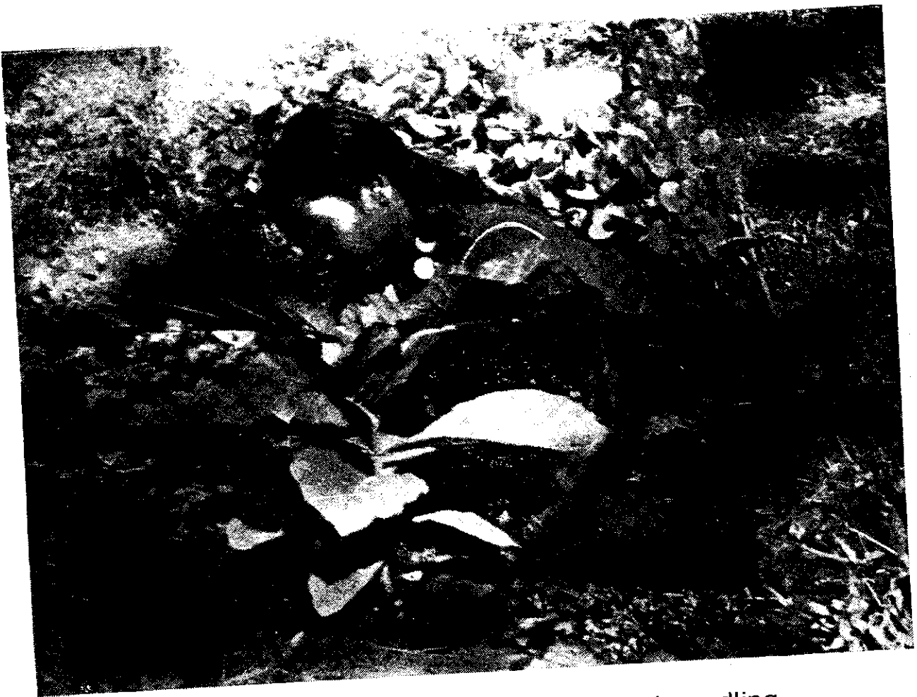
A tribal girl engaged in planting a teak seedling