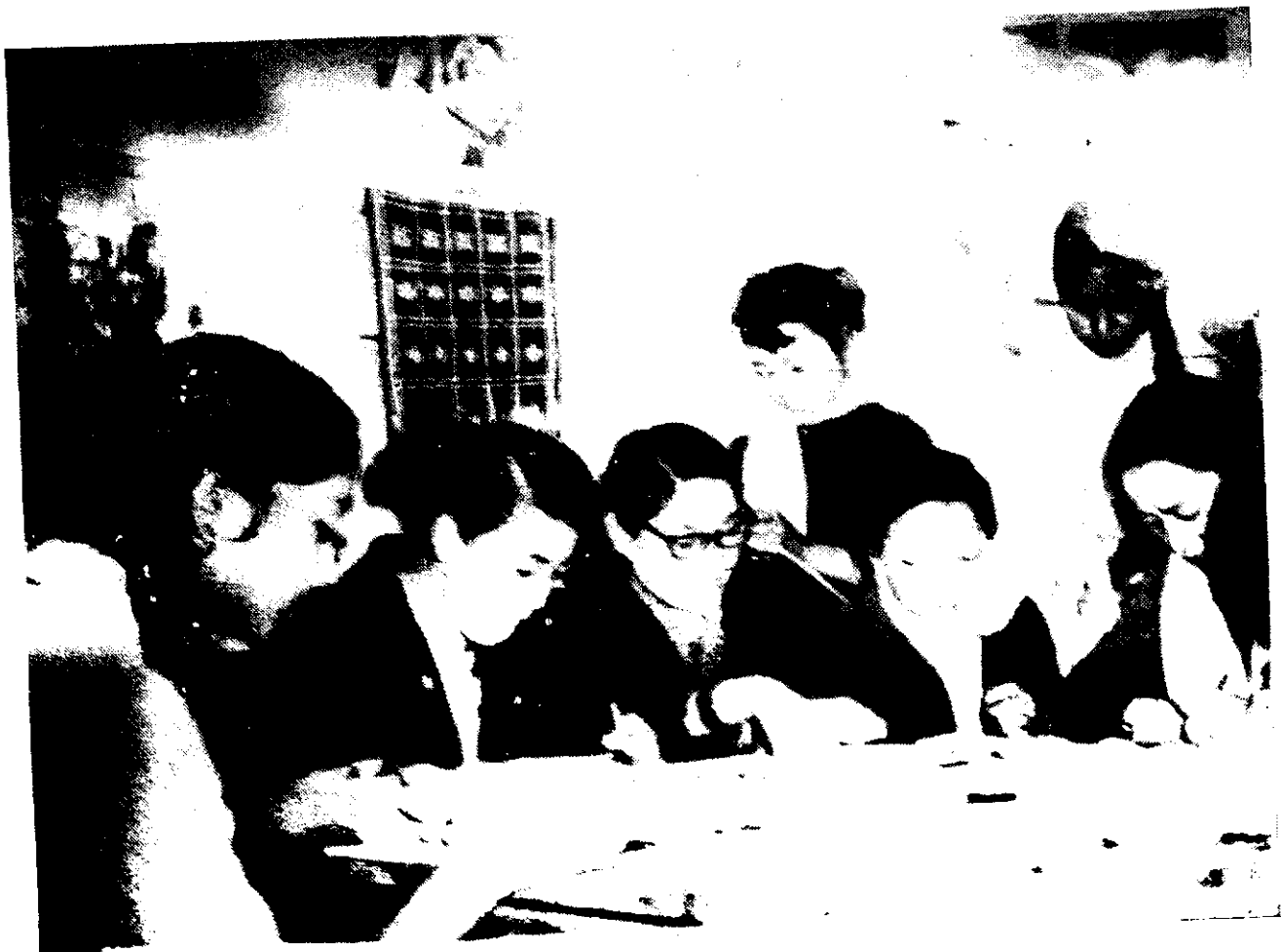
A welfare camp of Lepcha and Bhutia women in North Eastern States