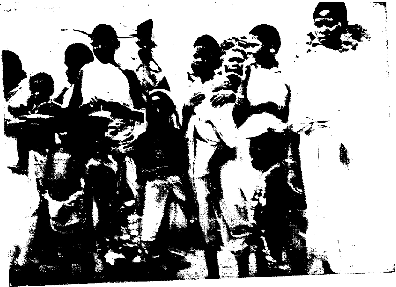
Rehabilitated 'Birhor' women of Village Jehangutwa, District Ranchi (Bihar)