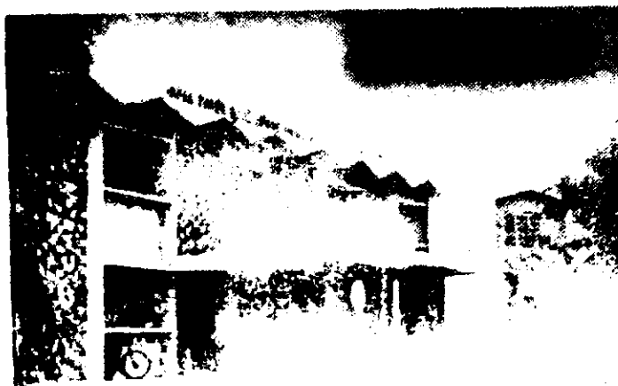
Institute of Printing Technology, Madras