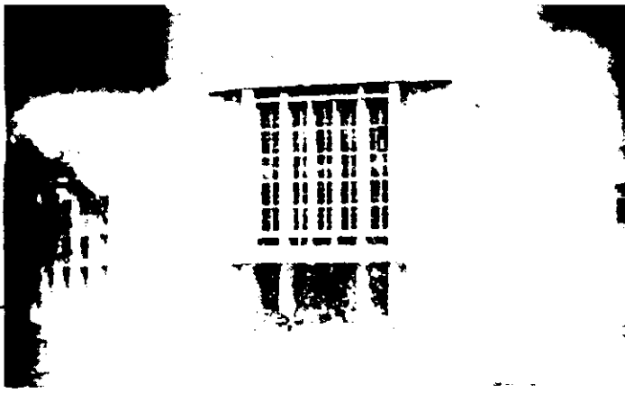
Government Polytechnic for Women, Madras