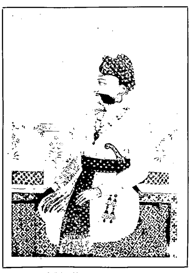
GOVIND HARI PATWARDHAN, (A.D. 1741—1771.)