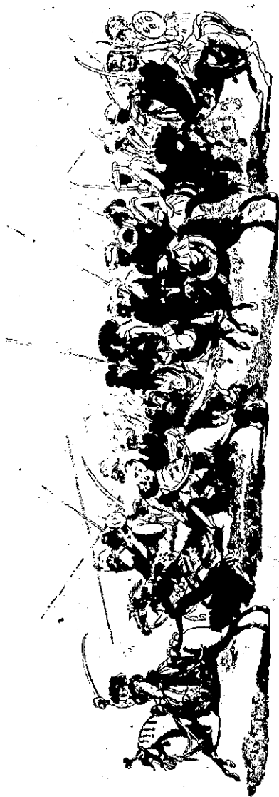
The Head of the Advanced Guard of the Marathas. They were engaged to fight at the Battle of Panipat, May 1857.