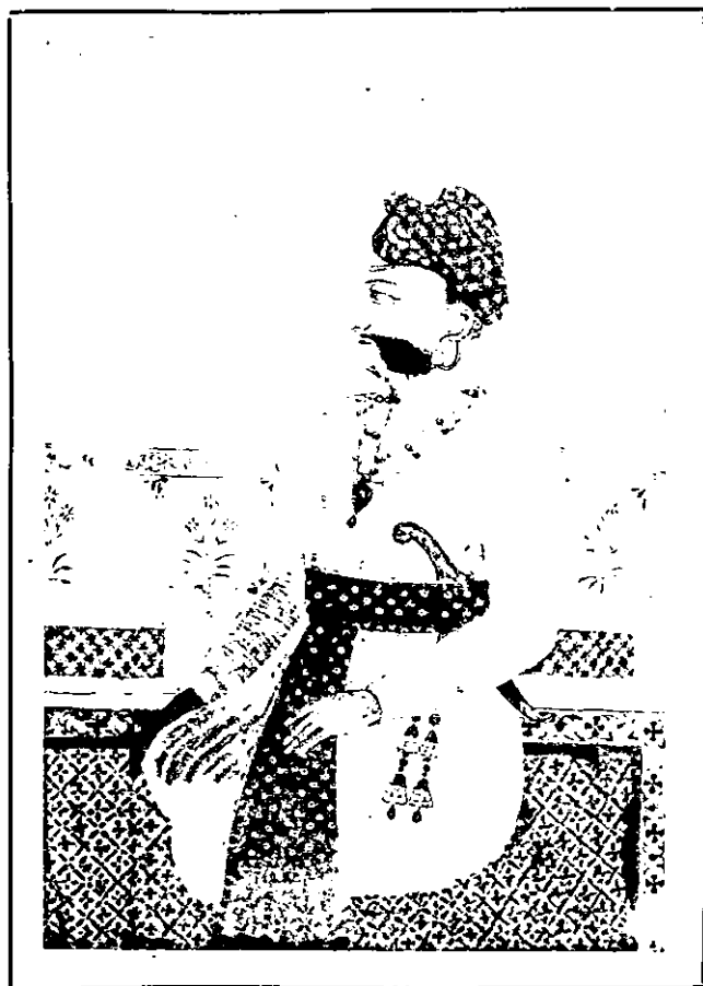
GOVIND HARI PATWARDHAN, (A.D. 1741—1771.)