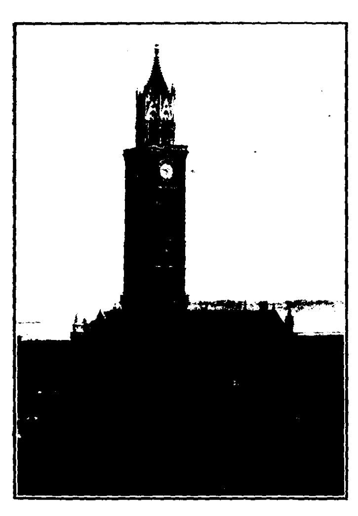
THE RAJABAI CLOCK TOWER.