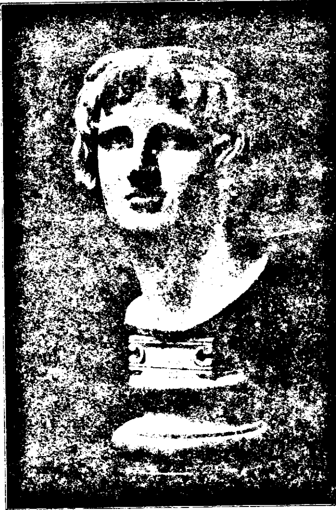
BUST OF ALEXANDER THE GREAT. (British Museum.)