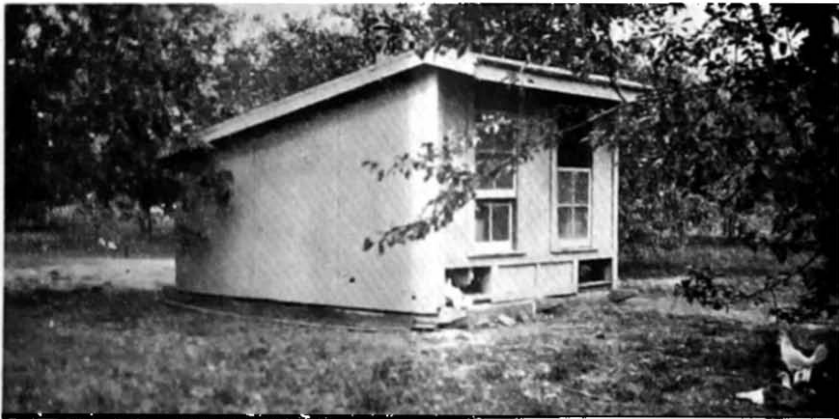
A brooder house on skids, that may be moved to clean ground, will help to keep down chick losses

Poultry and eggs for market. The size of the flock to be maintained for commercial egg production will depend largely upon the extent to which the operator desires to make poultry raising a specialty enterprise. For a flock of 250 hens the feed required would be five times the amount listed in the table on page 20. Other figures given for the 50-hen flock discussed on pages 16 to 17 may be multiplied by