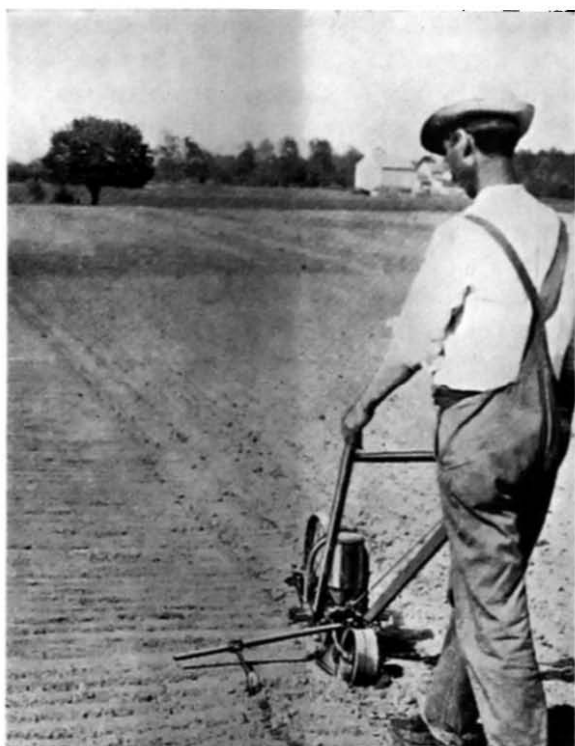
A combined seed drill and wheel hoe is a useful tool in the small-farm garden, whether the garden is only for family use or is on a commercial scale

Growing a few special products of high quality will probably bring better returns than an attempt to operate a general market garden.