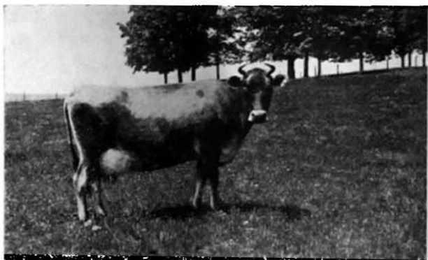
A good cow is a much better investment than a poor one

An inexperienced person should not attempt to buy a cow unaided. The farm adviser or some competent farmer should be called upon for advice and help. The cow selected should have a sound udder, free of lumps and hardened tissue. She should be an easy milker, and have teats of good size. The milk should be free of clots, flakes, or