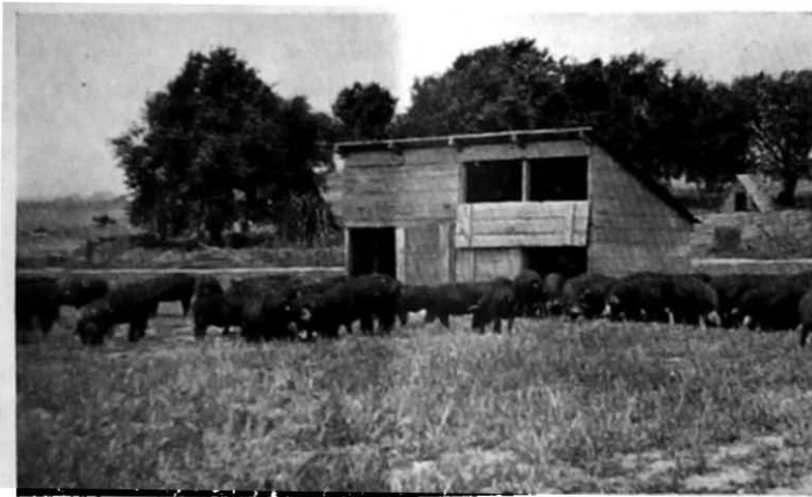
Not much space or equipment, but plentiful amounts of feed, are needed for raising hogs on a commercial scale

Raising hogs on commercial scale. The feed supply is the important consideration in determining the practical limits to the raising of hogs on a commercial scale on the small farm. Nearly 16 bushels