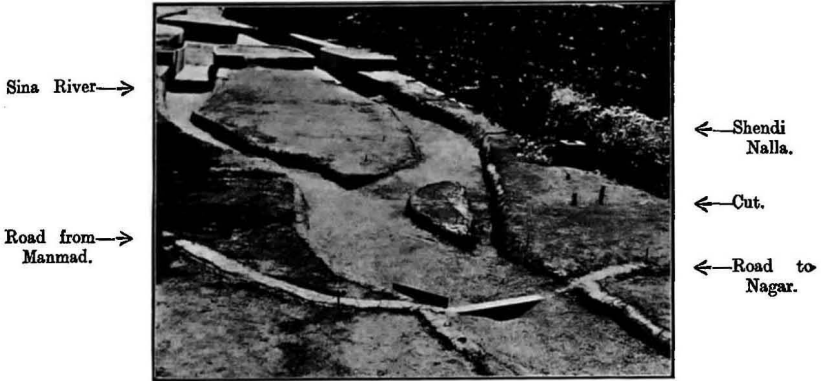
1399.— Model of junction of the Sina River and Shendi Nala in experiments 8 and 9. Looking upstream.