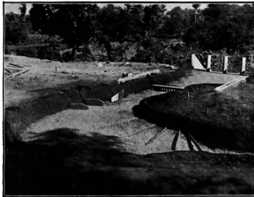
1401.— Experiment 9 with old groyne lengthened on left bank and 5 groynes round the convex right bank. Looking downstream.