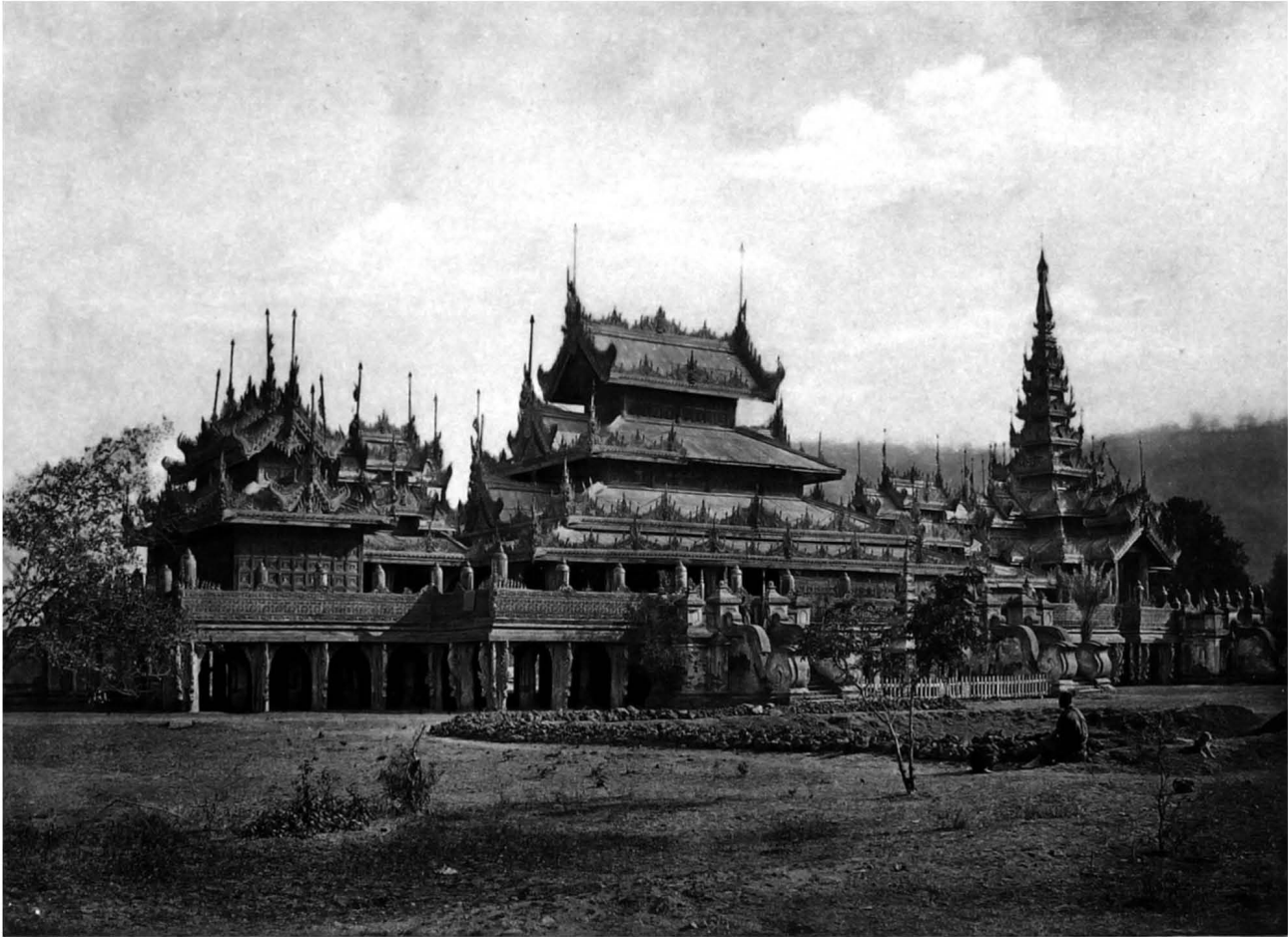
SALIN MONASTERY. — MANDALAY.