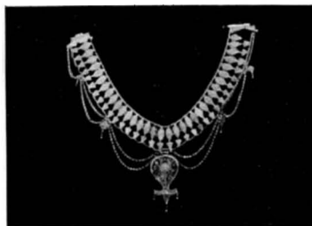
Fig 1. BARPETA NECKLACE.