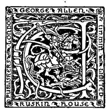
GEORGE ALLEN & UNWIN LTD LONDON: 40 MUSEUM STREET, W.C.: CAPE TOWN: 73 ST. GEORGE'S STREET SYDNEY, N.S.W.: WYNYARD SQUARE AUCKLAND, N.Z.: 41 ALBERT STREET TORONTO: 77 WELLINGTON STREET, WEST