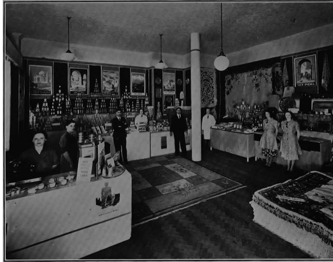
HULL SHOP, 1938.