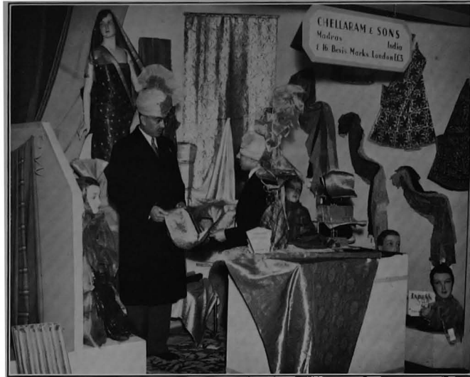
TEXTILES SECTION, BRITISH INDUSTRIES FAIR, 1939.