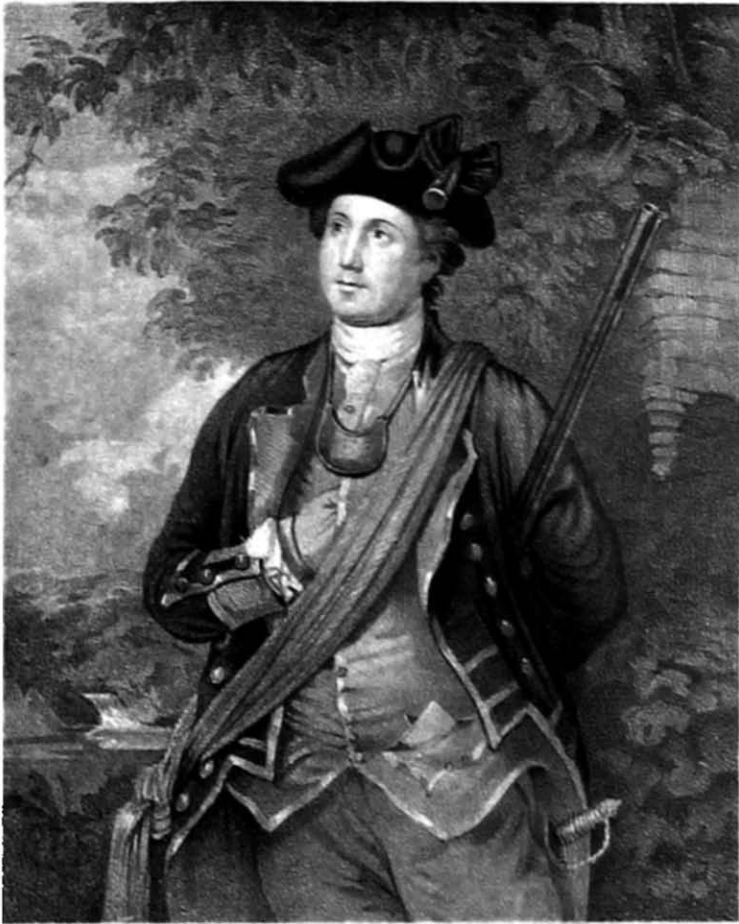
WASHINGTON. PLATE 40.

Great Marlborough Street, 1818.