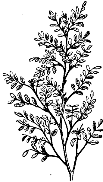
BRANCH OF INDIGO.