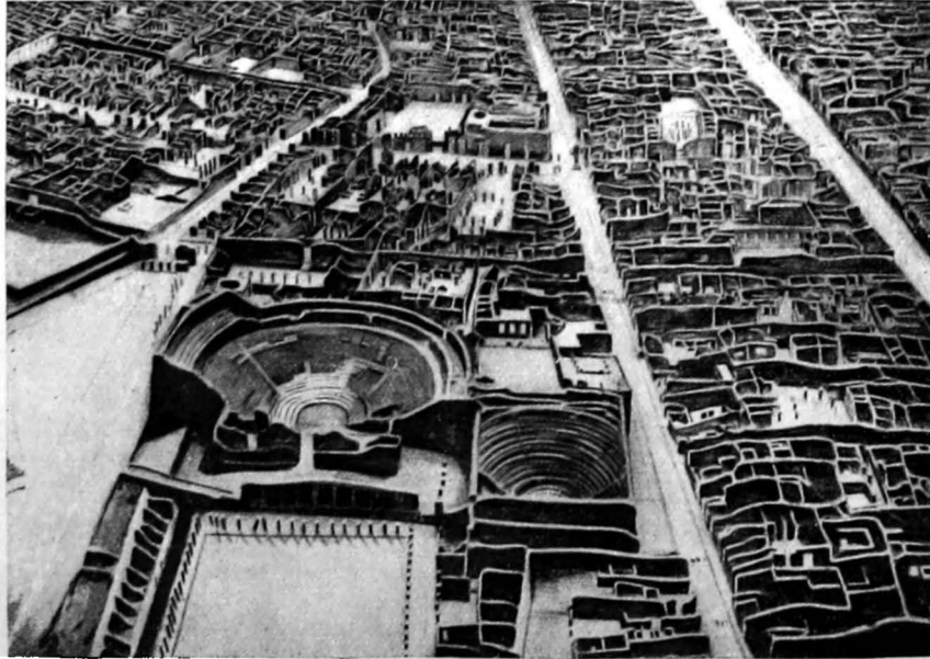
VIEW OF EXCAVATED POMPEII (From a photograph)