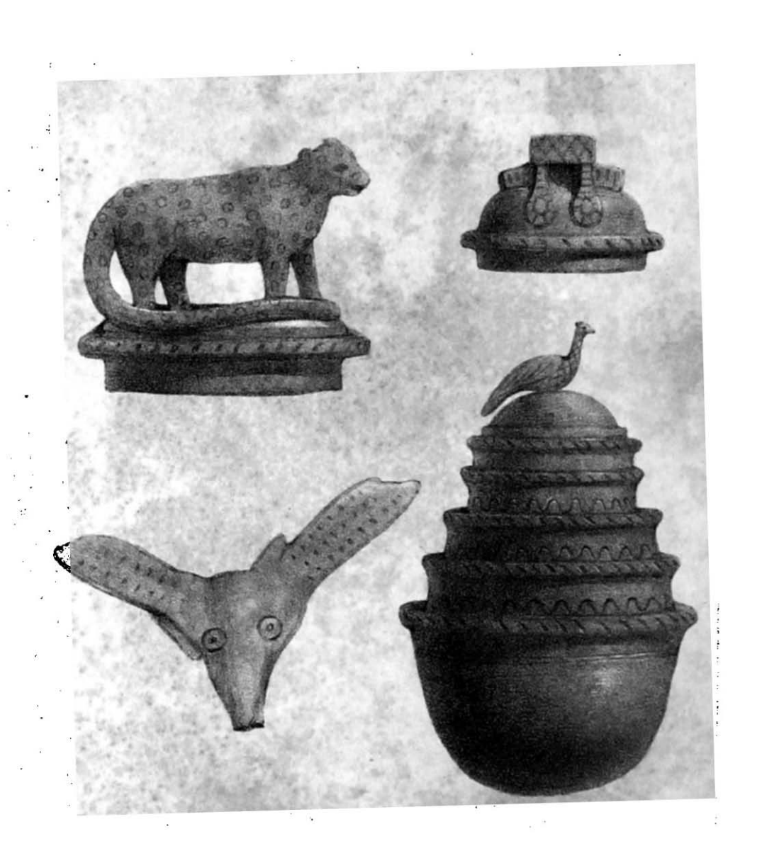
Antiquities FOUND IN THE CAIRNS OF CARONI, on the Neilgherry Mountains.