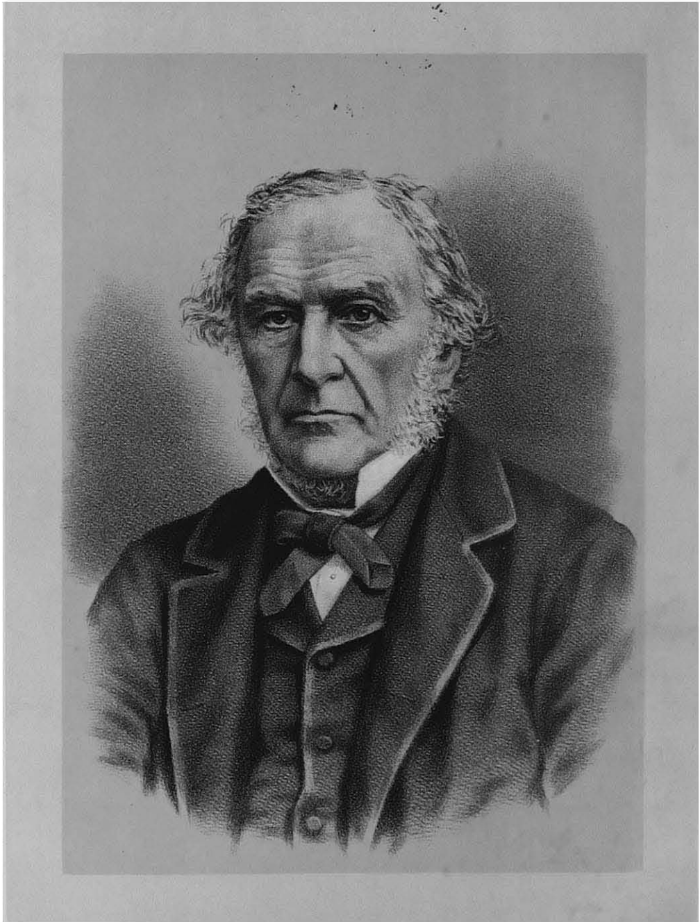
WILLIAM EWART GLADSTONE.