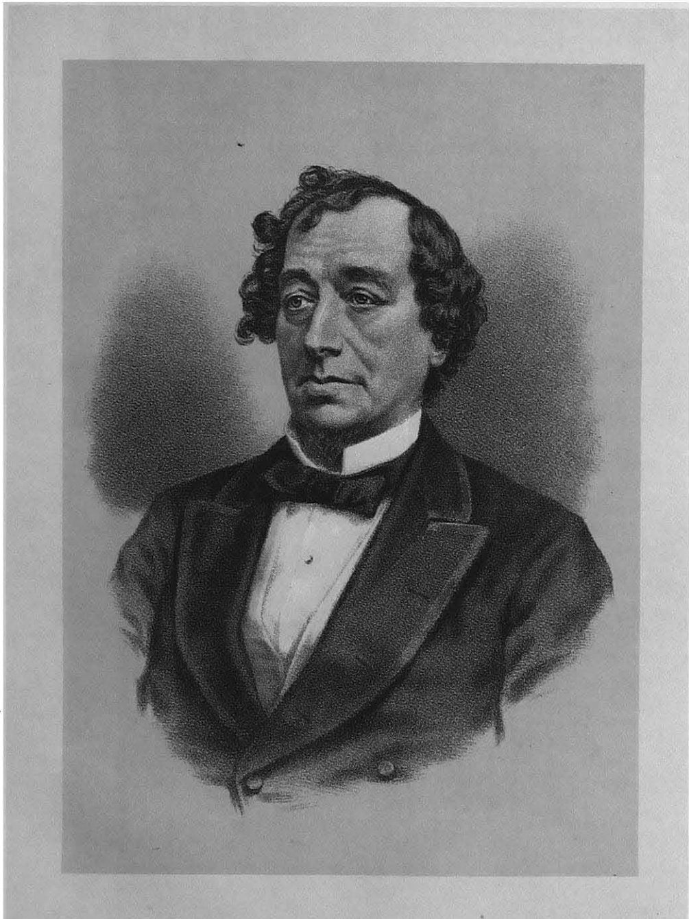
BENJAMIN D'ISRAELI EARL OF BEACONSFIELD