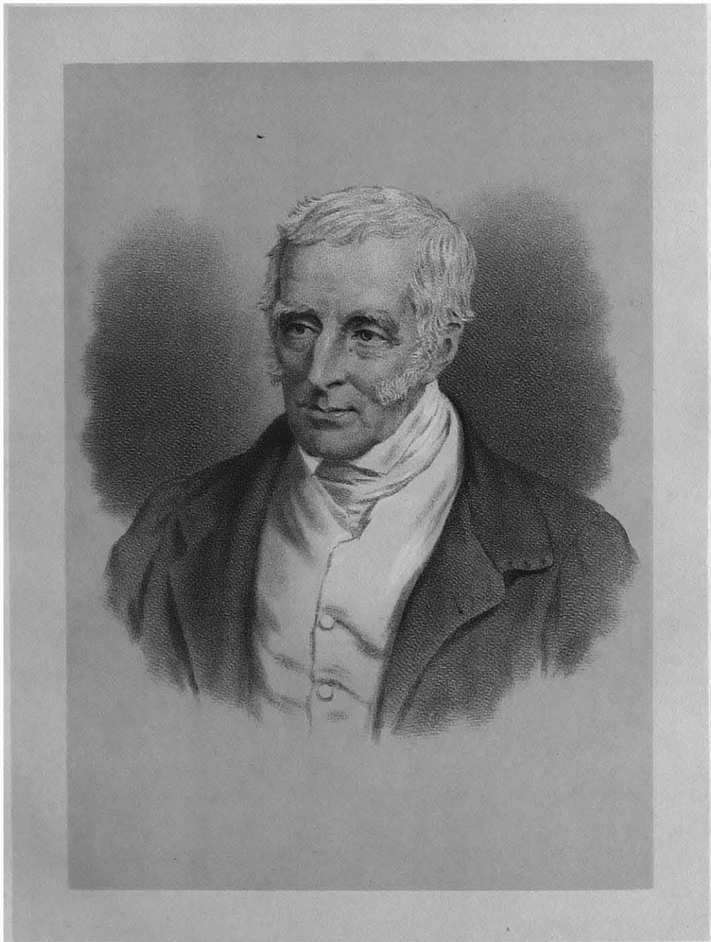
FIELD MARSHALL THE DUKE OF WELLINGTON, K. G. FROM THE DAGUERROTYPE BY CLAUDET.

BLACKIE & SON, LONDON, GLASGOW, EDINBURGH & DUBLIN