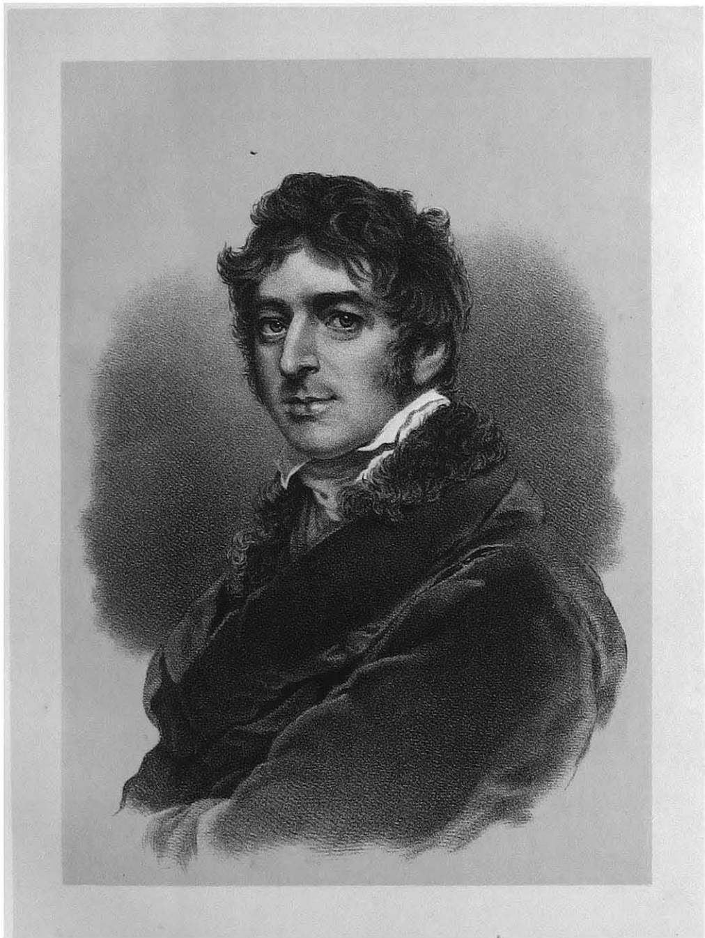
WILLIAM LAMB. SECOND VISCOUNT MELBOURNE Premier 1834 and 1835-1841. FROM THE PORTRAIT BY SIR THOS LAWRENCE P R A

BLACKIE & SON, LONDON, GLASGOW, EDINBURGH & DUBLIN.