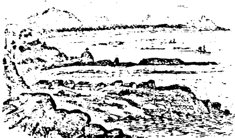
VIEW OF SEA COAST FROM MUTTAN.