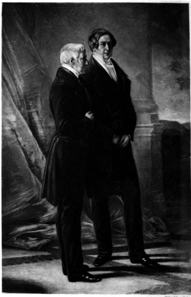
The Duke of Wellington and Sir Robert Peel from the picture by Sir Martin Archer Shee in the possession of Her Majesty the Queen.