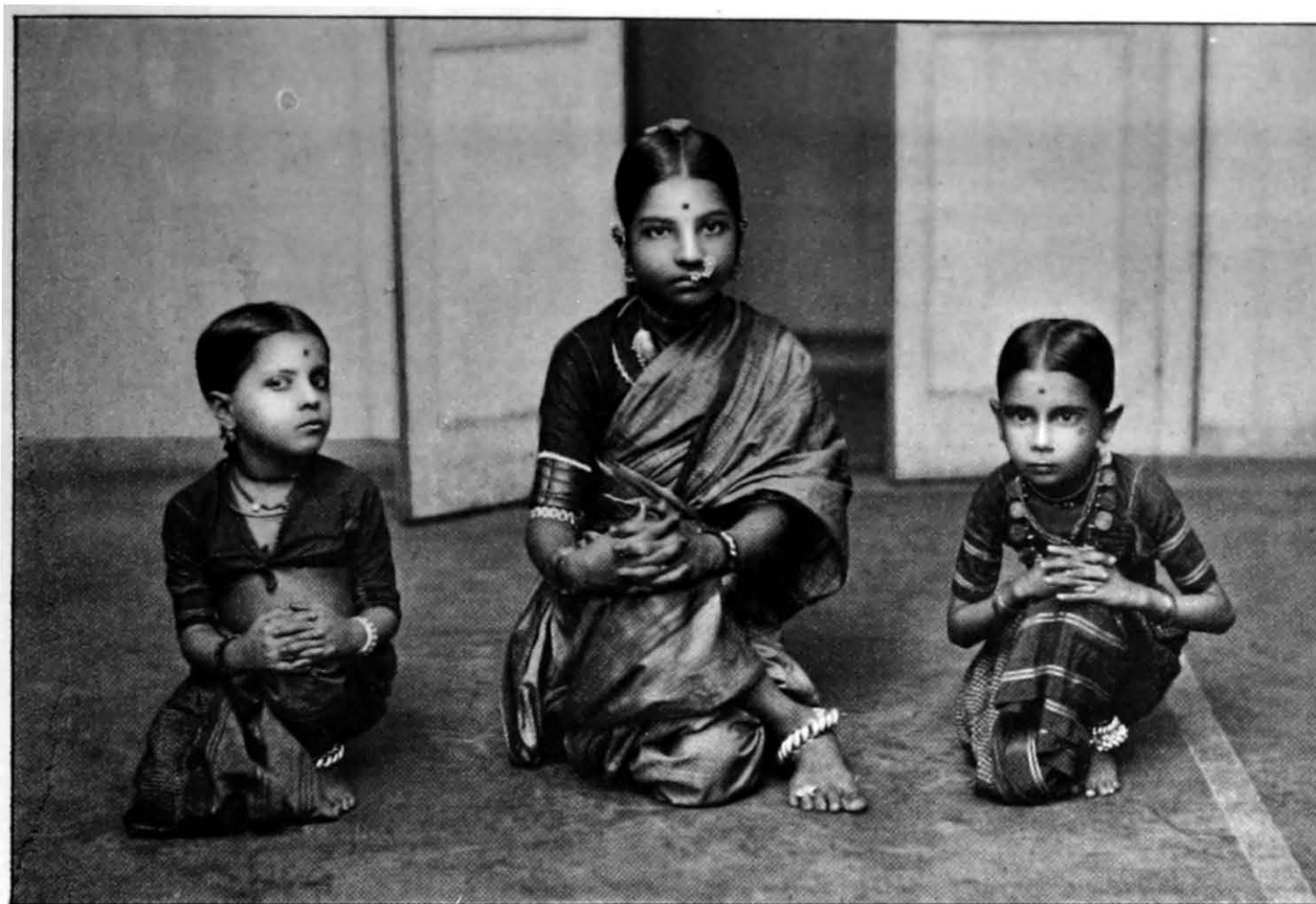
CEREMONIES AND GREEN RUSHES—A DRESS REHEARSAL.