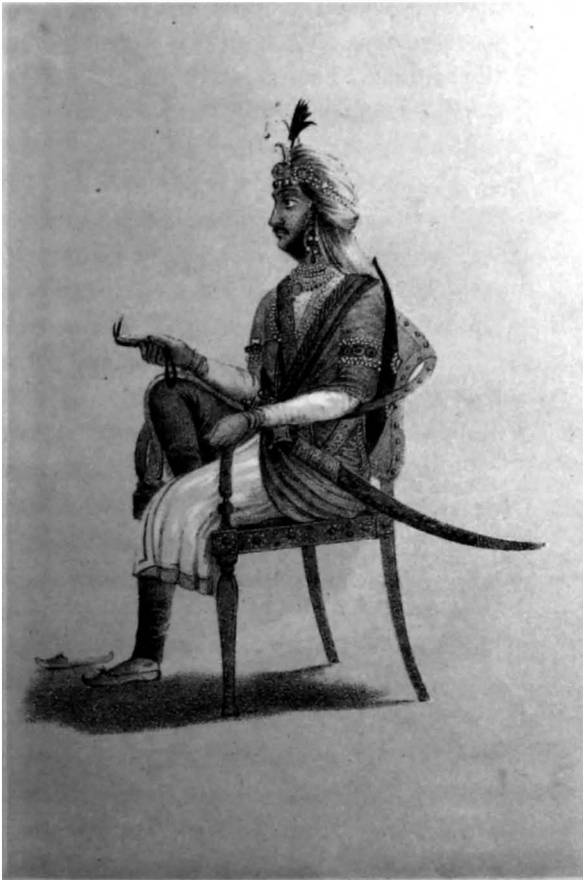
Ma. Jure Macdonald & Macgregor, Ltd. London