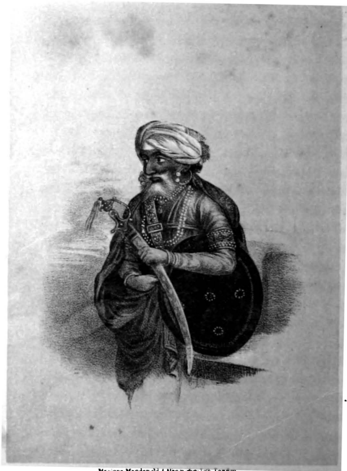
MAHARAJAH GOOLAB SINGH.