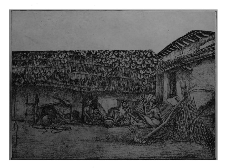
THE PEASANT OF THE PERIOD: HIS HUT AND HIS IMPLEMENTS