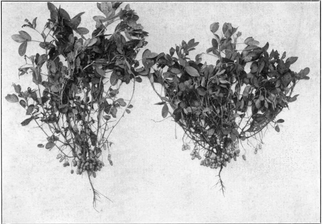
ERECT AND TRAILING TYPES OF GROUND NUT PLANTS