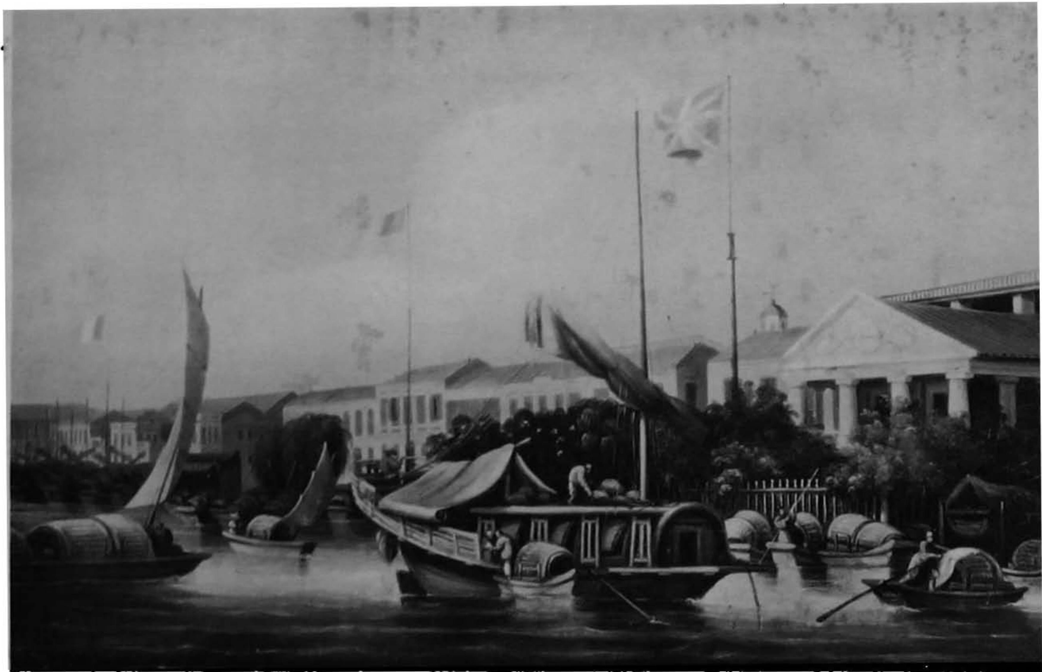
THE CANTON FACTORIES, c. 1832