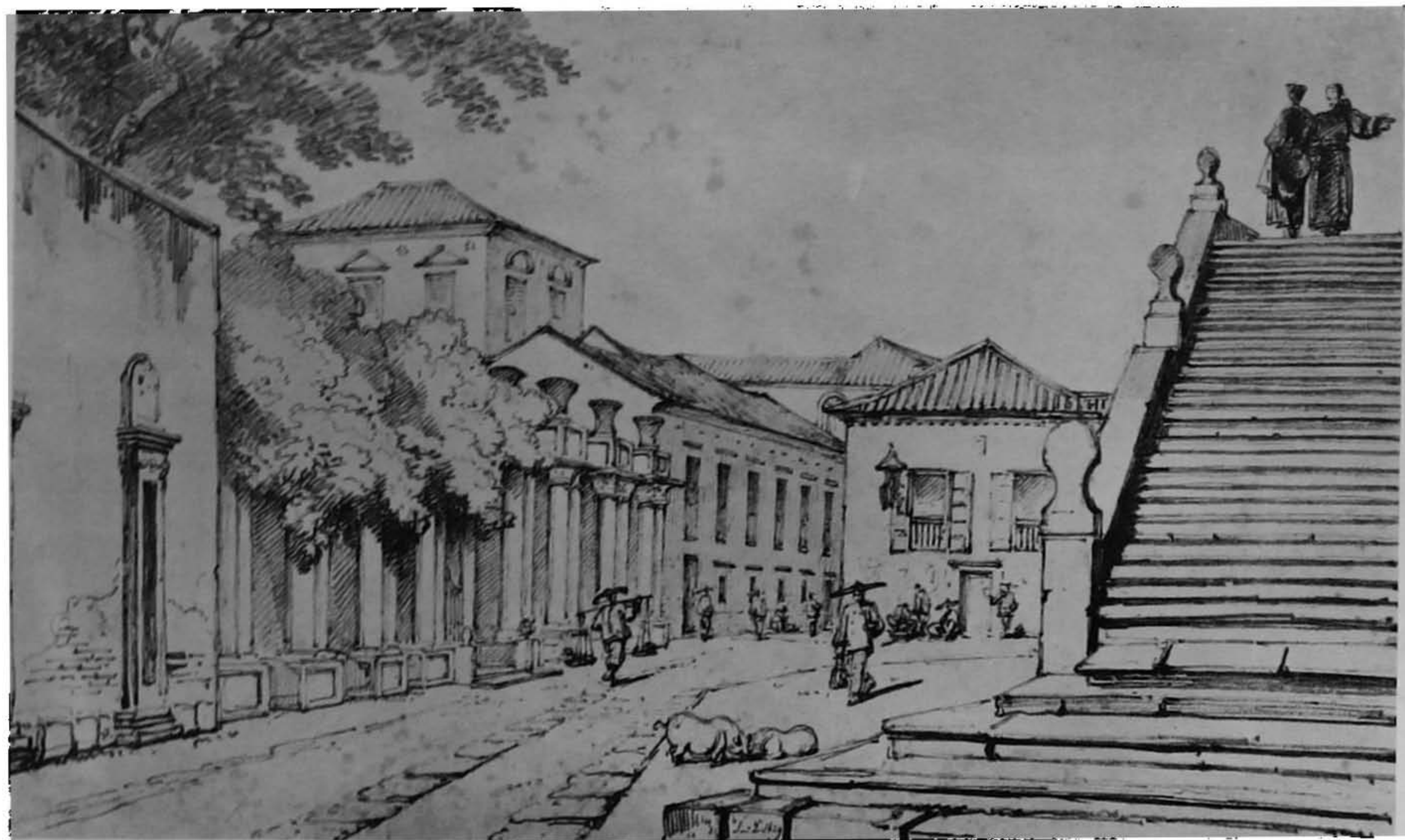
THE EAST INDIA CO. FACTORY AT MACAO