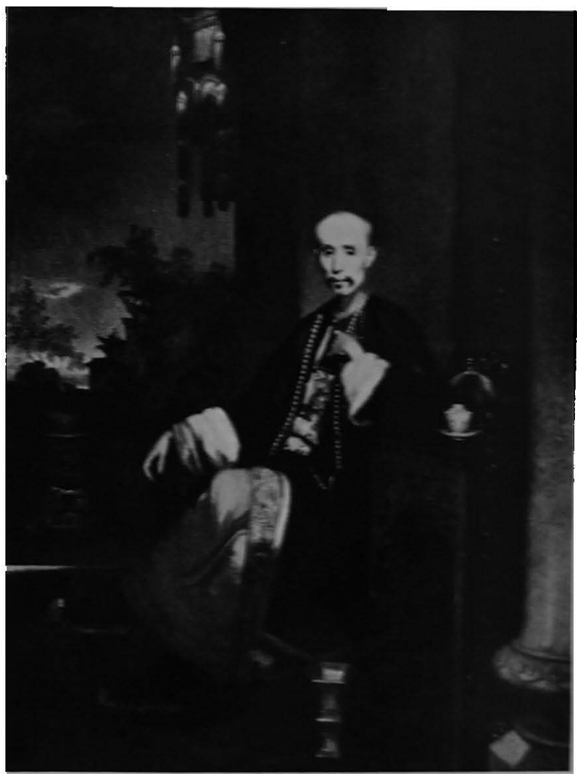
HOWQUA, ALSO KNOWN AS FUQUA