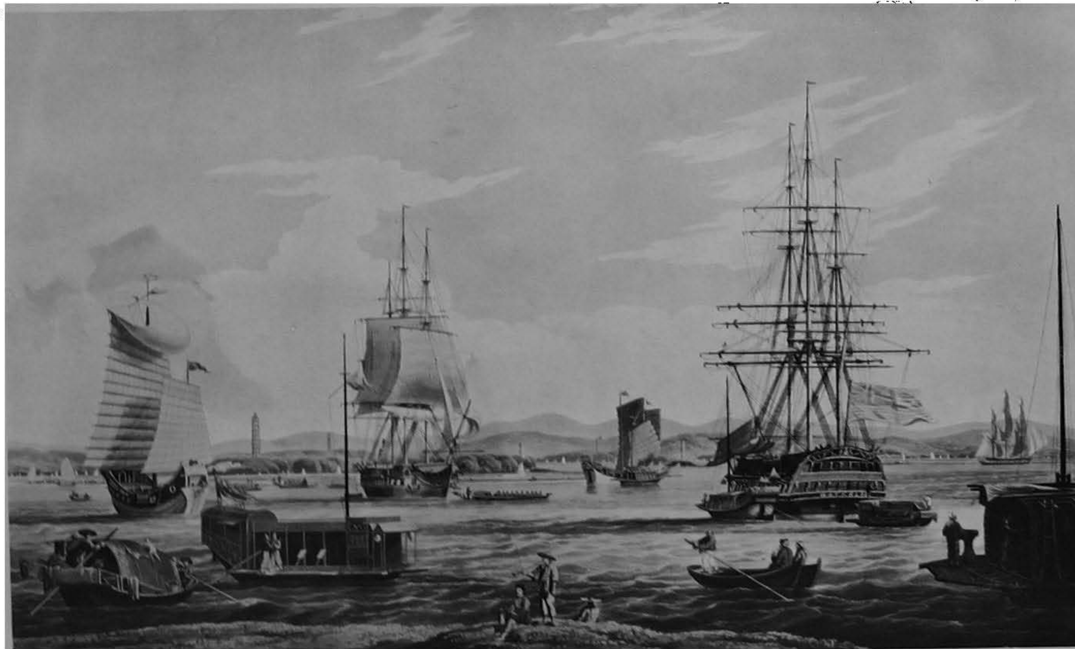
THE E. I. C. OWN SHIP WATERLOO