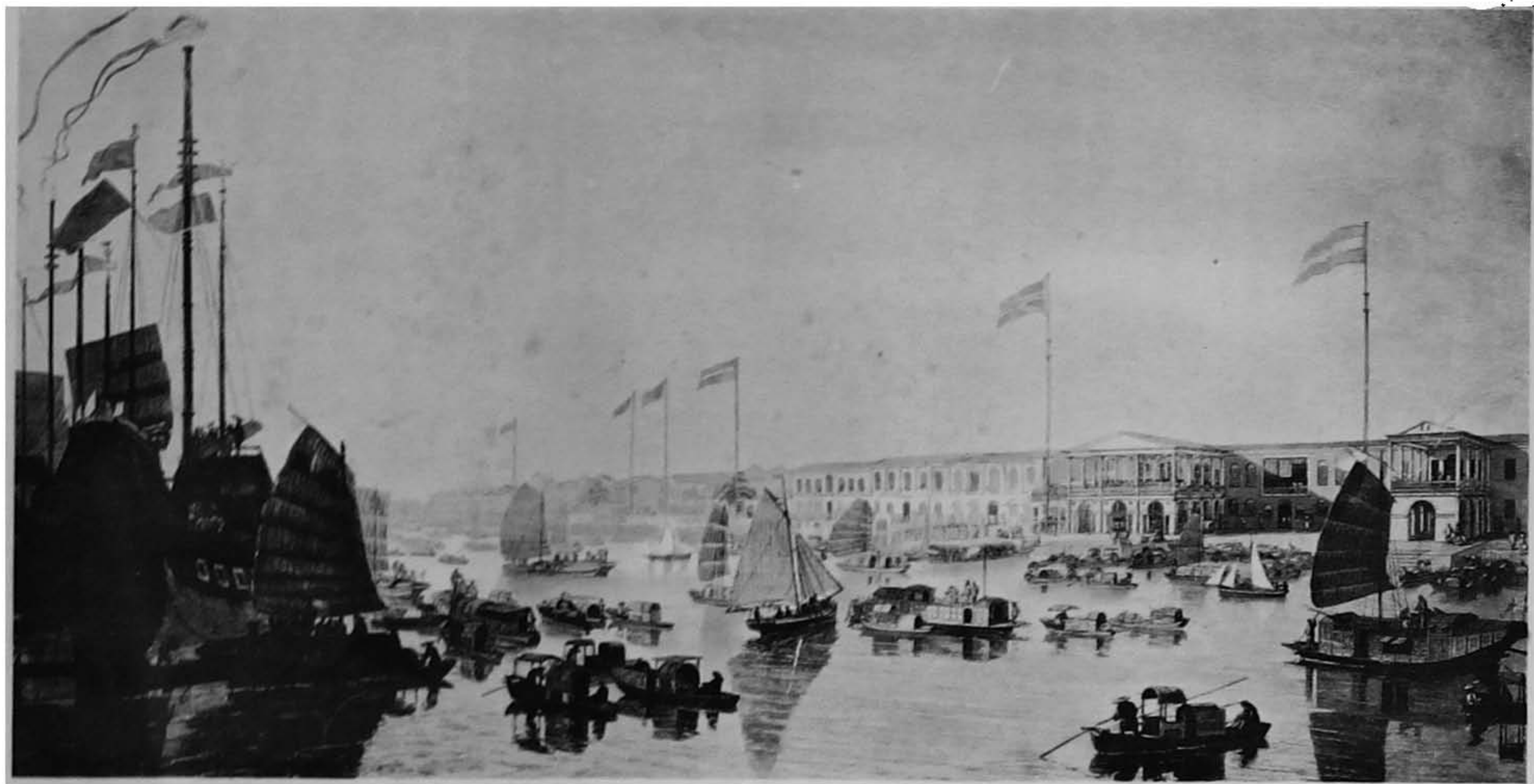
THE CANTON FACTORIES, 1785