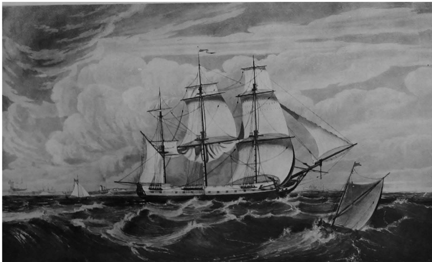
THE E. I. C. CHARTERED SHIP TRUE BRITON